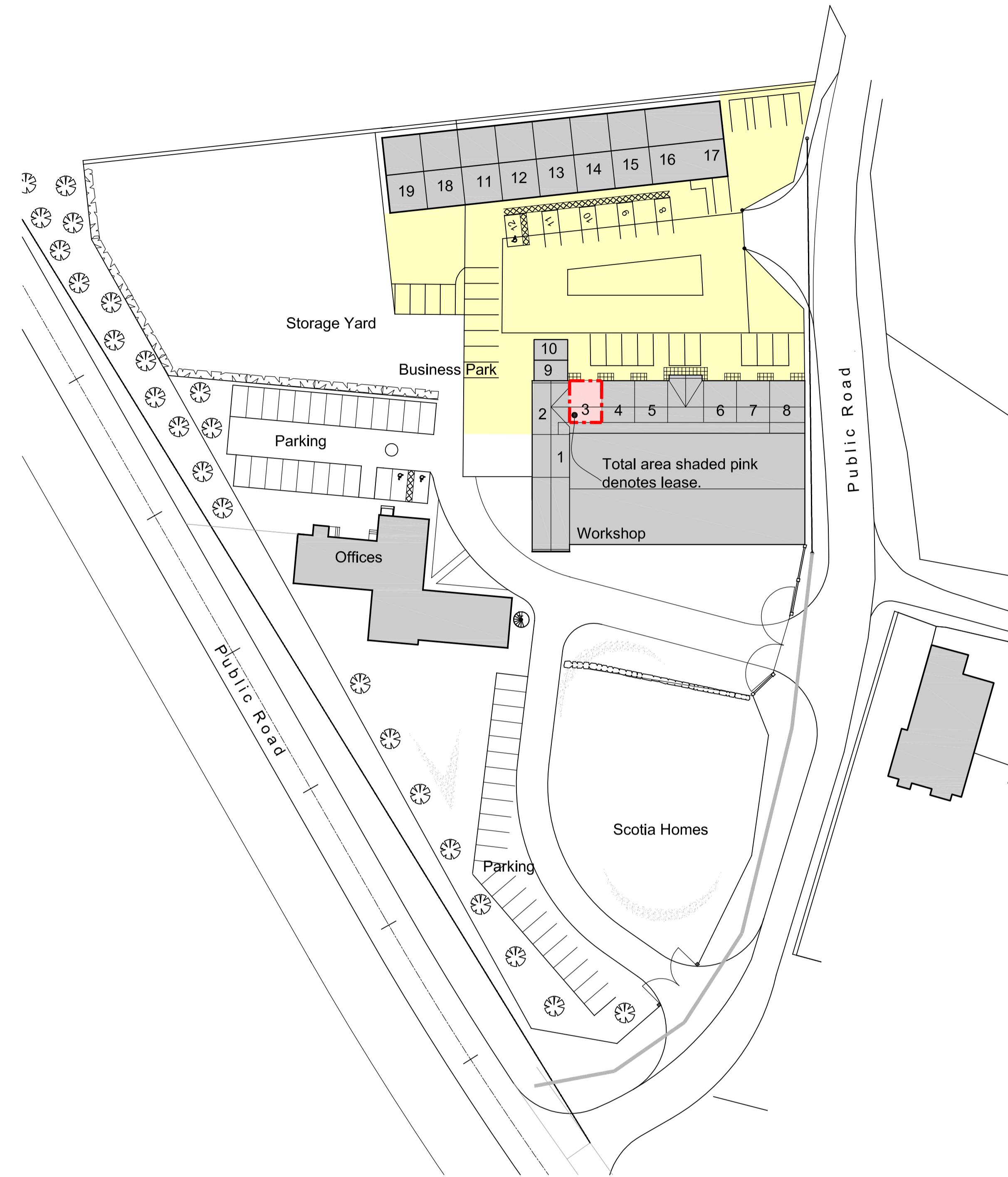
Site Layout Plan: Scale 1:500