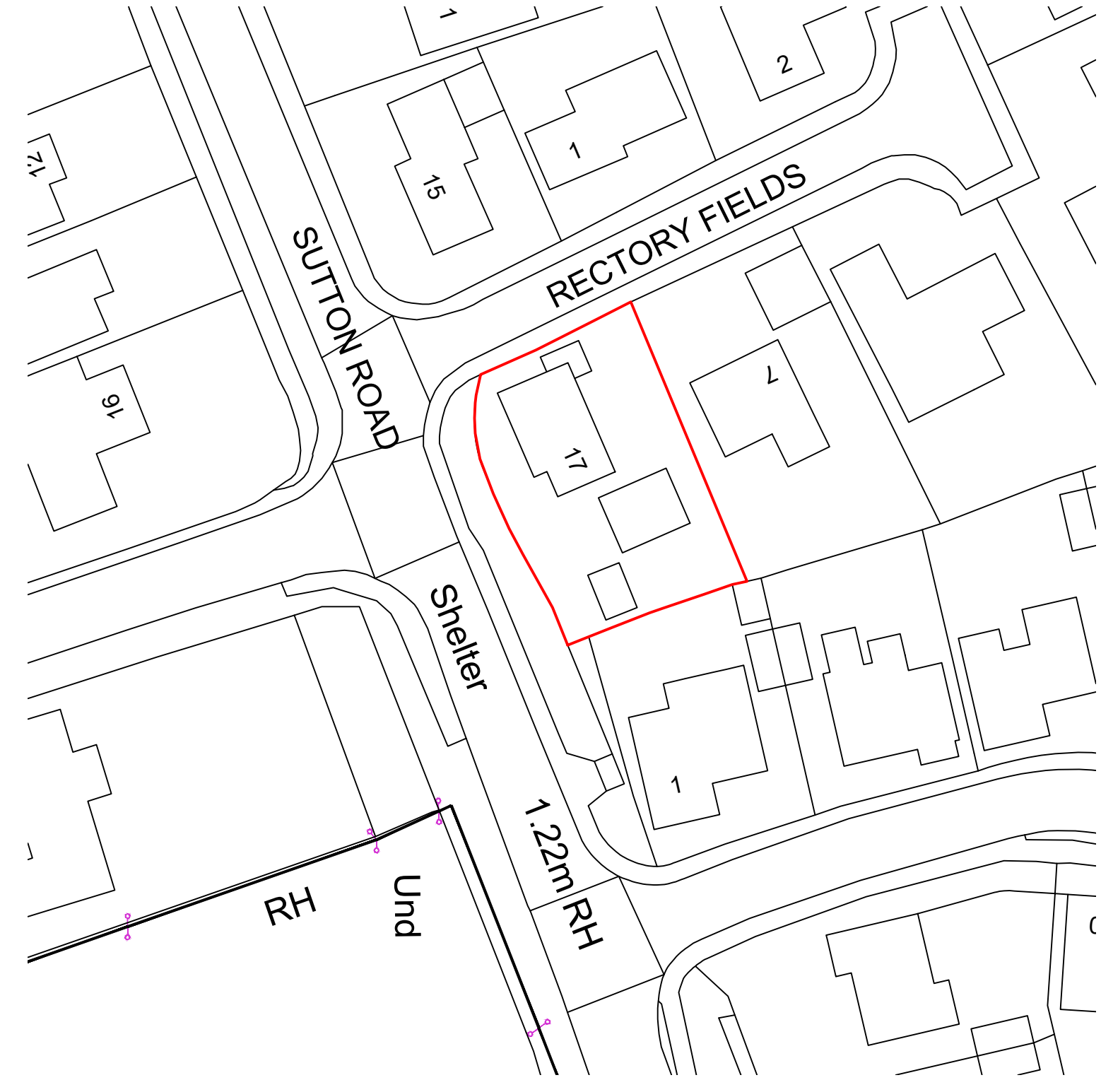
1:500 Existing Site Plan