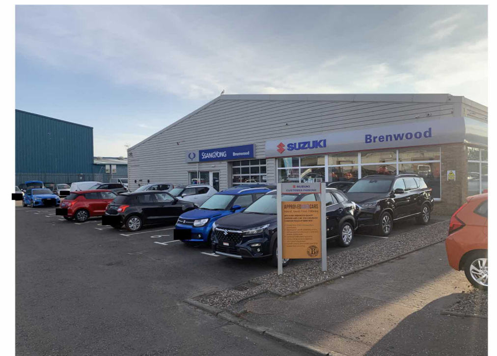
Photo 02 - Existing Premises