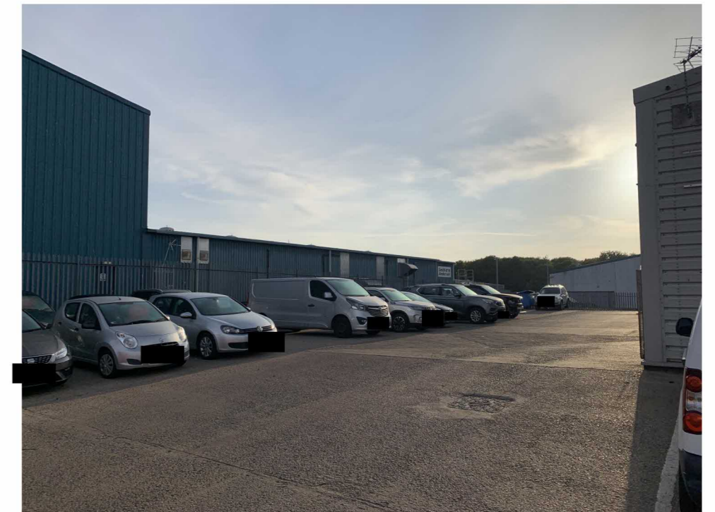
Photo 01 - Proposed location for new building