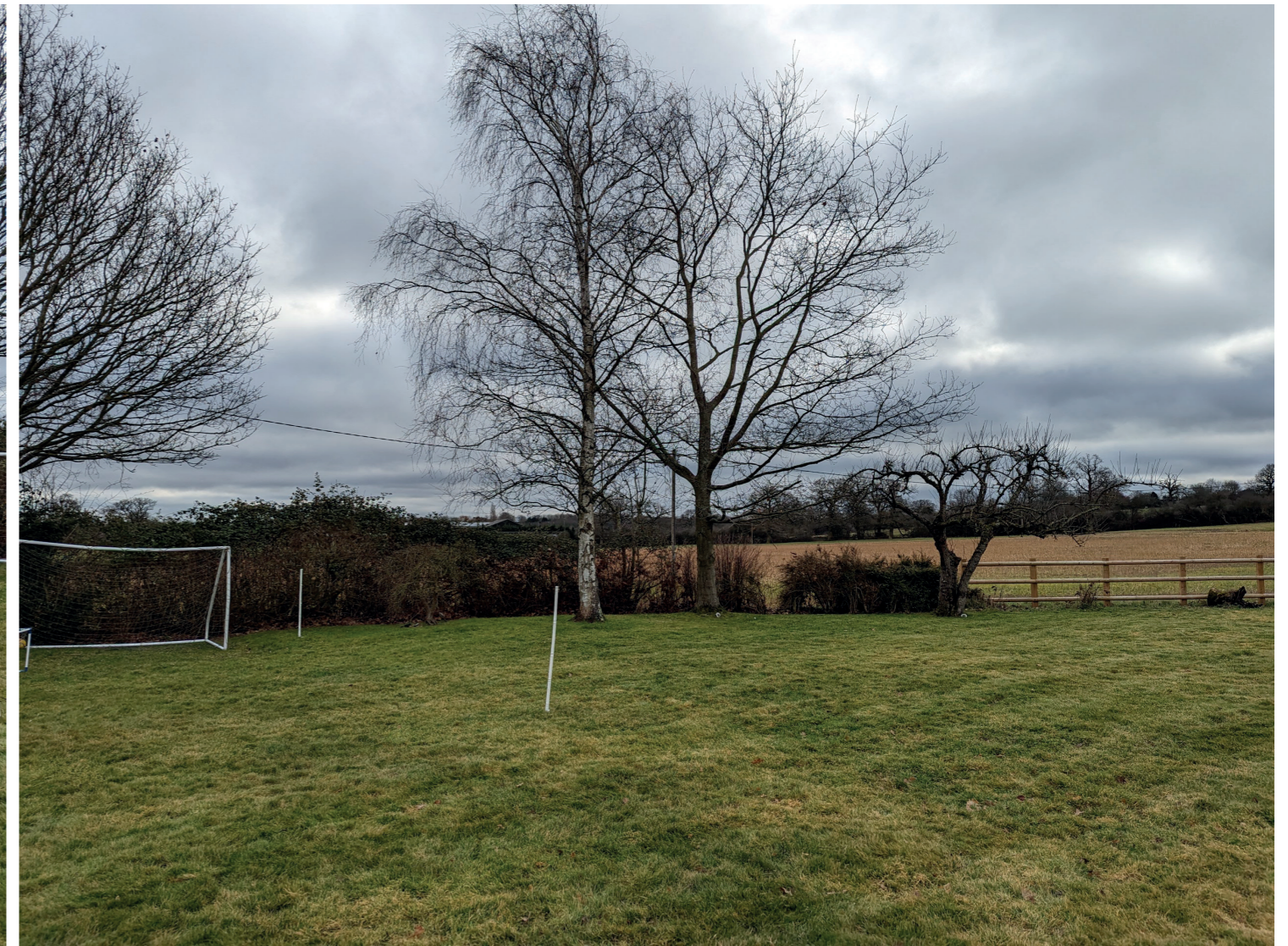
Photo of existing garden location where the proposed oak frame gazebo will be sited. (Please refer to drawing ref. 2050-P-01 DEEVES HALL_LANDSCAPE PLAN PROPOSED)