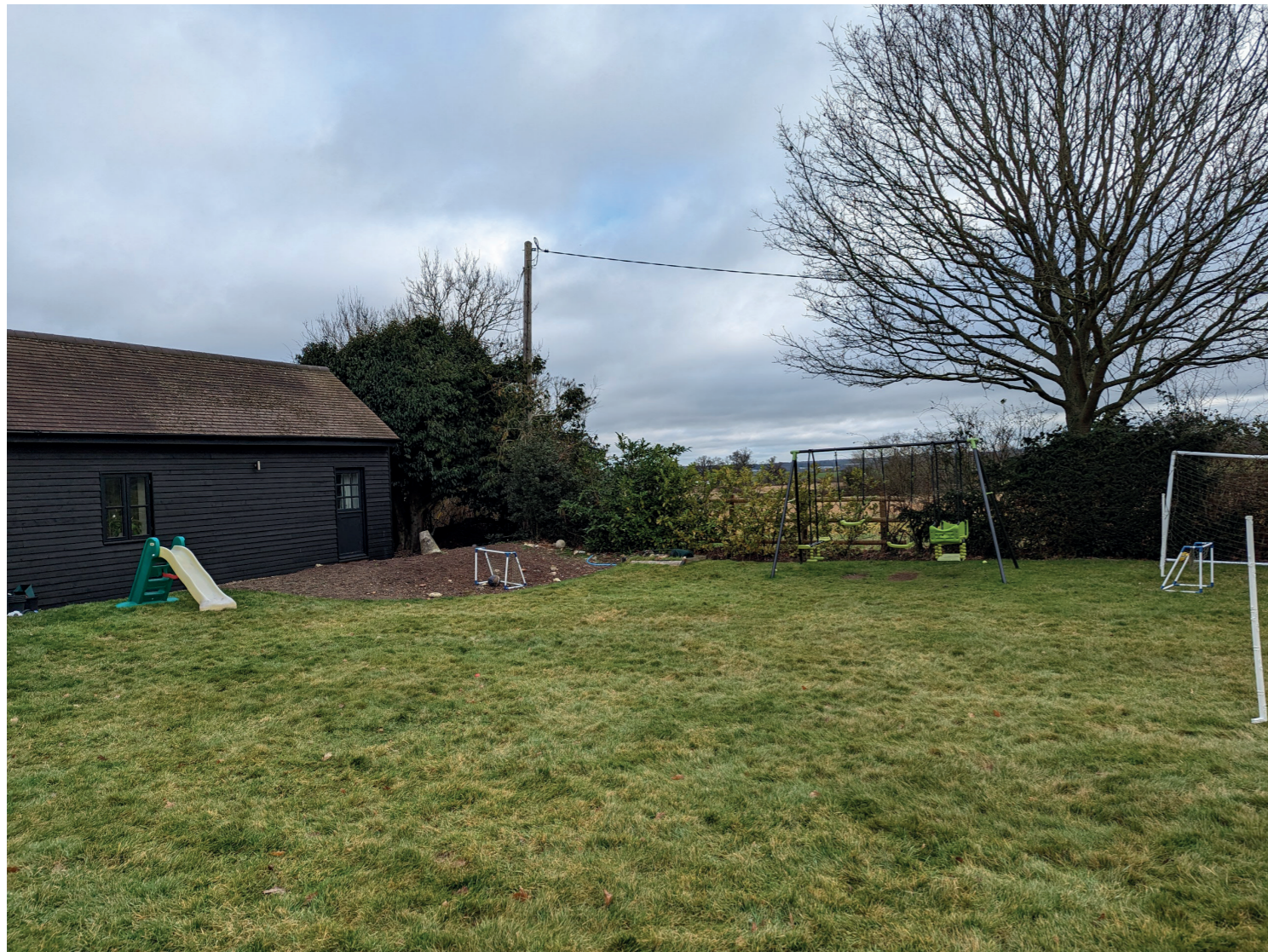
Photo of existing garden location where the proposed outdoor swimming pool and new boundary wall will be sited. (Please refer to drawing ref. 2050-P-01 DEEVES HALL_LANDSCAPE PLAN PROPOSED)