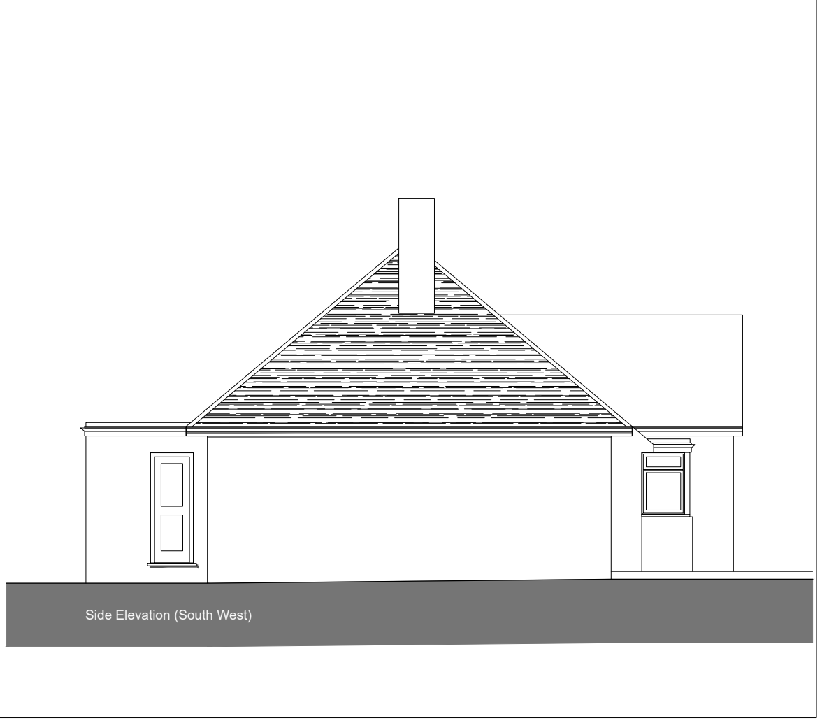
Side Elevation (South West)

contractors should request dimensions where none have been provided - do not estimate dimensions from drawings. all dimensions to be checked on site