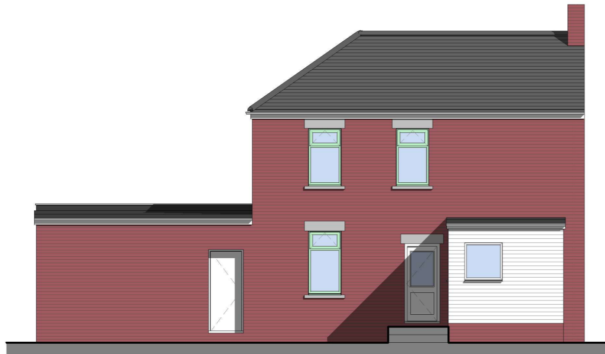
3 Rear Elevation 1 : 100