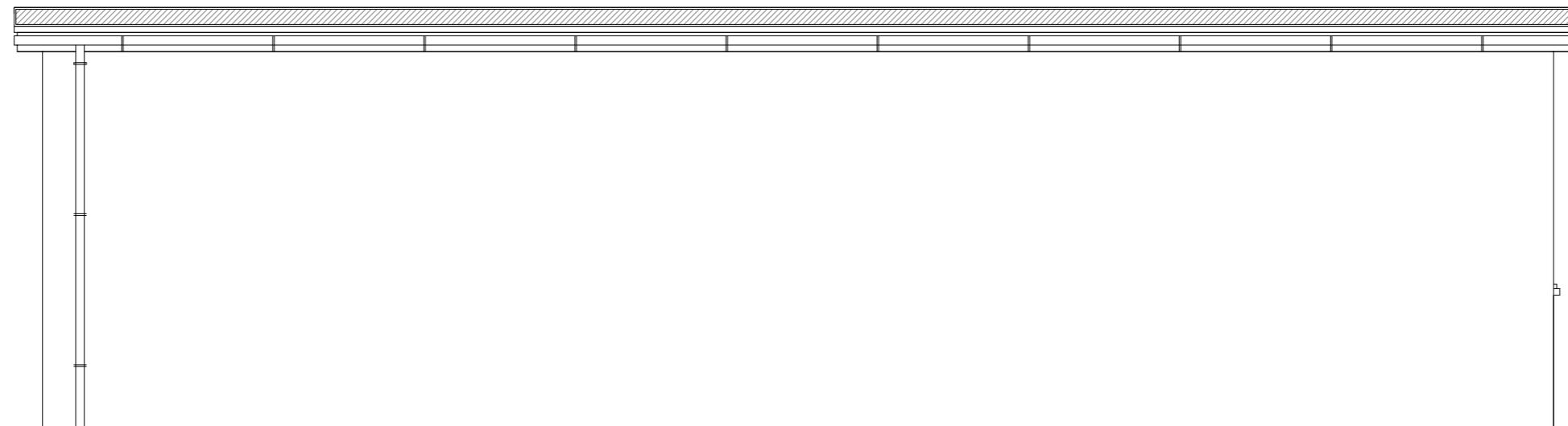
EXISTING REAR ELEVATION Scale: - 1 : 50