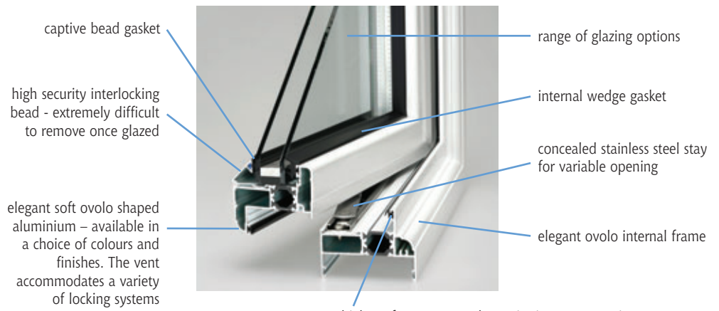
high performance weather stripping prevents air and water ingress