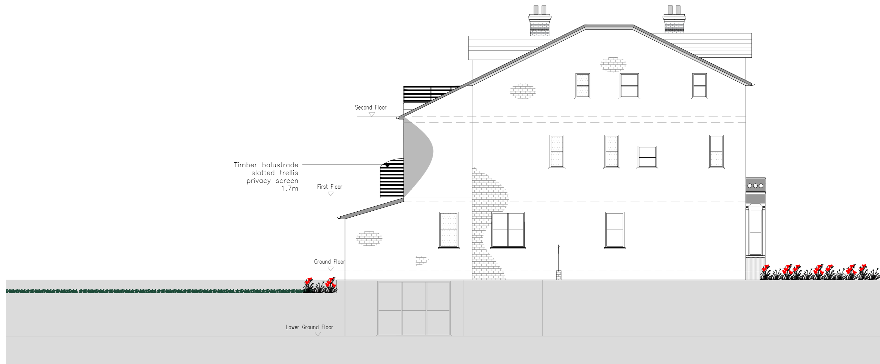
PROPOSED SIDE ELEVATION - B Scale: 1:100