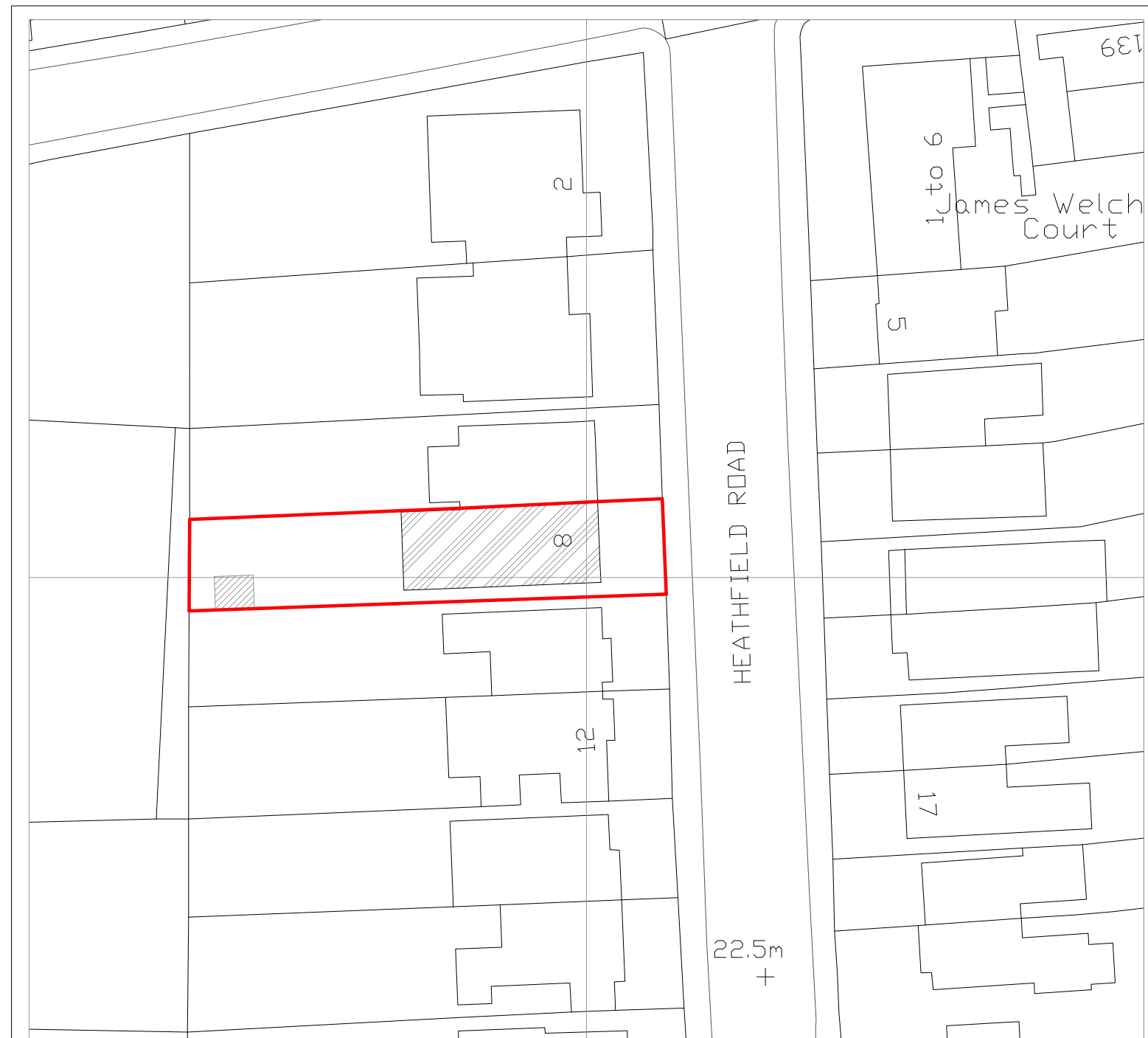
BLOCK PLAN Scale: 1:500