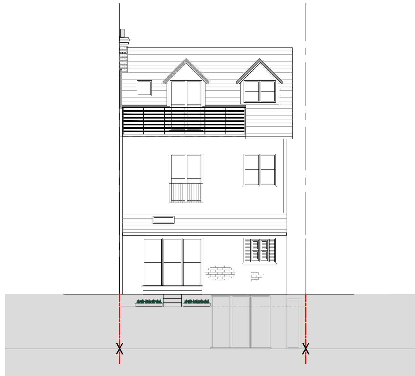
EXISTING REAR ELEVATION -C Scale: 1:100