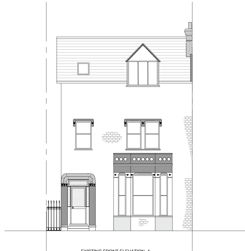
EXISTING FRONT ELEVATION -A Scale: 1:100