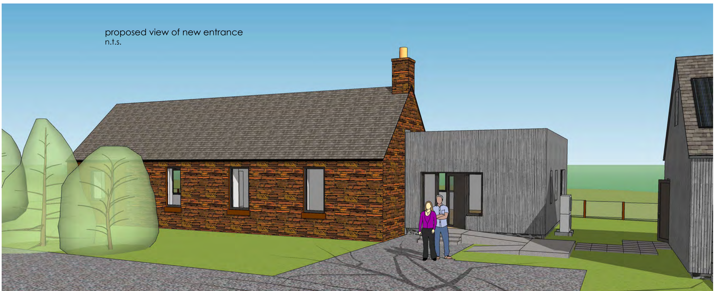
proposed view of new entrance n.t.s.