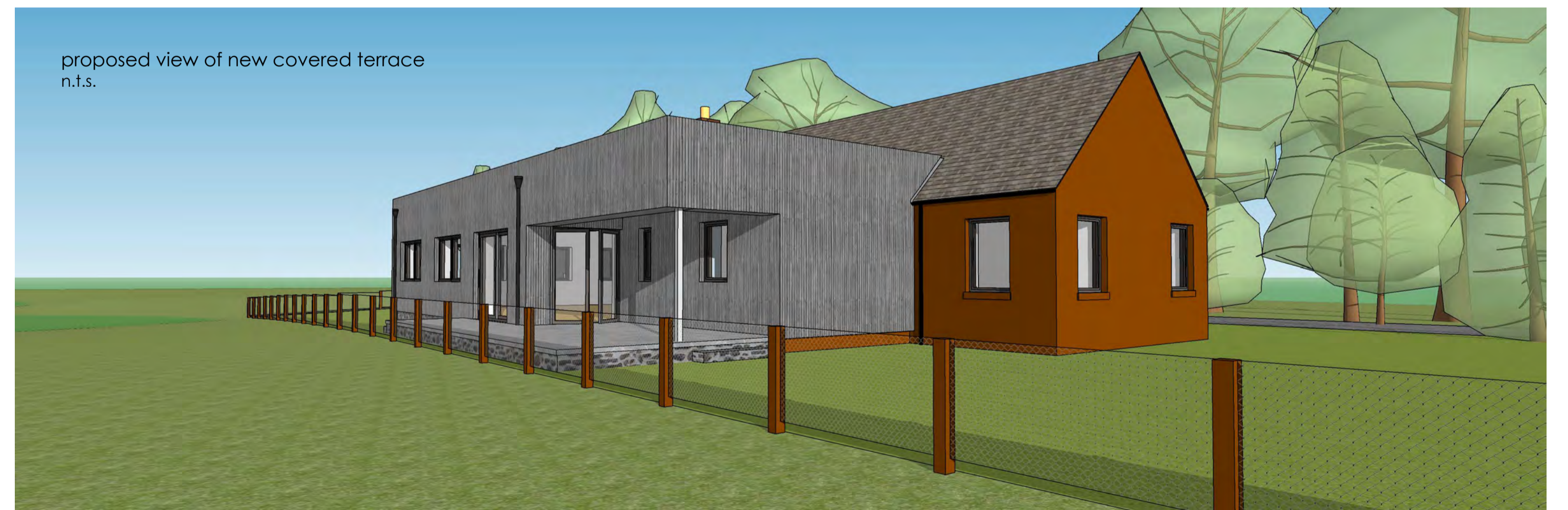
proposed view of new covered terrace n.t.s.

the information contained herein is produced specifically for the purposes noted and is not to be reproduced under any circumstances without the specific permissions of gary sinclair architecture