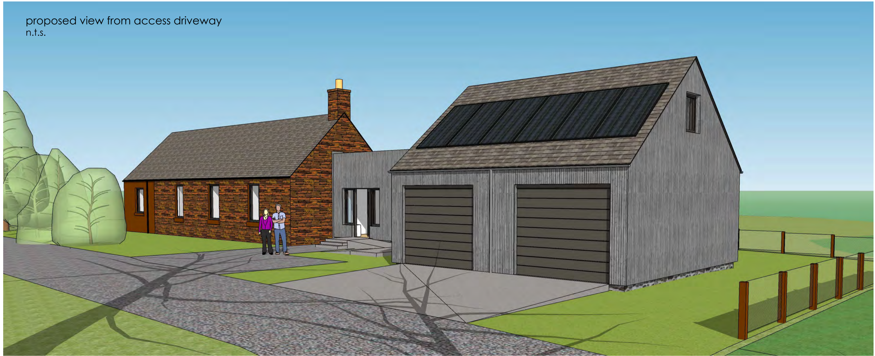
proposed view from access driveway n.t.s.