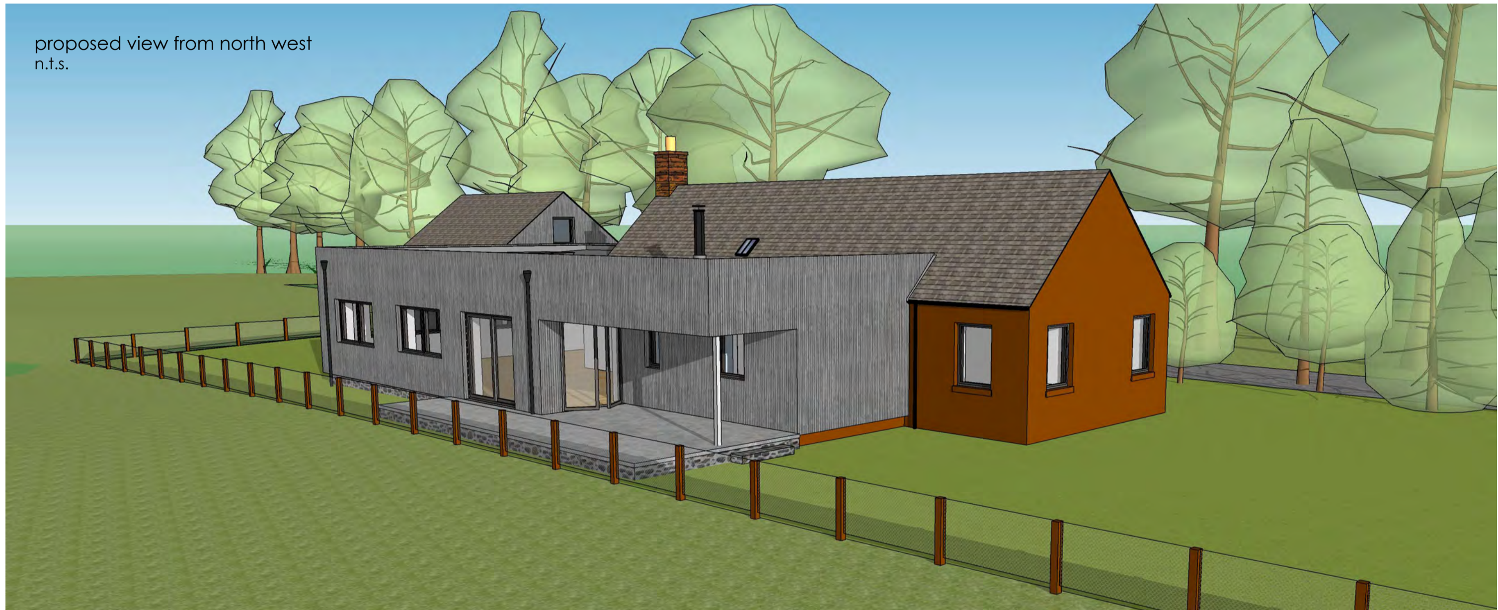
proposed view from north west n.t.s.