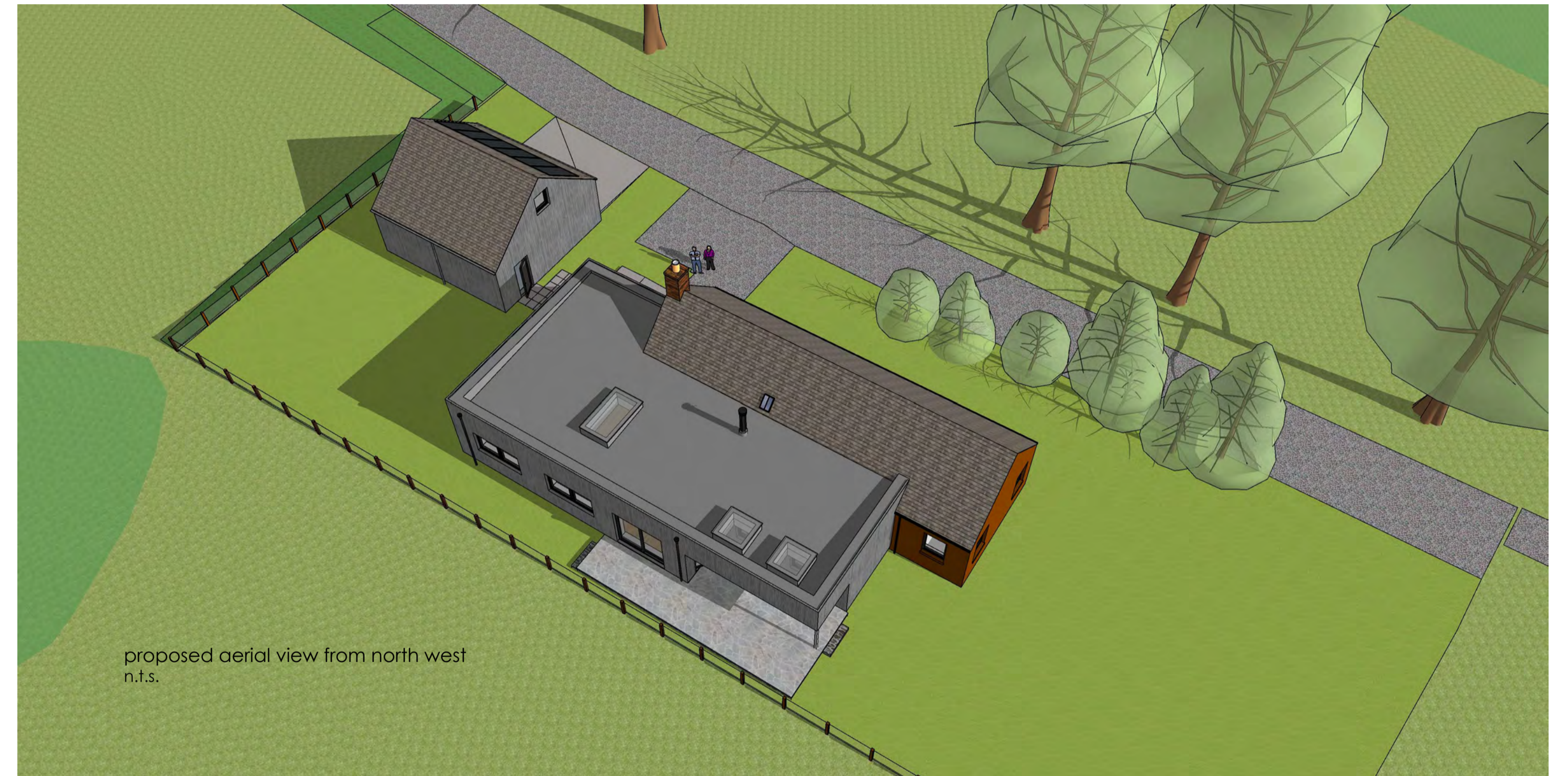
proposed aerial view from north west n.t.s.