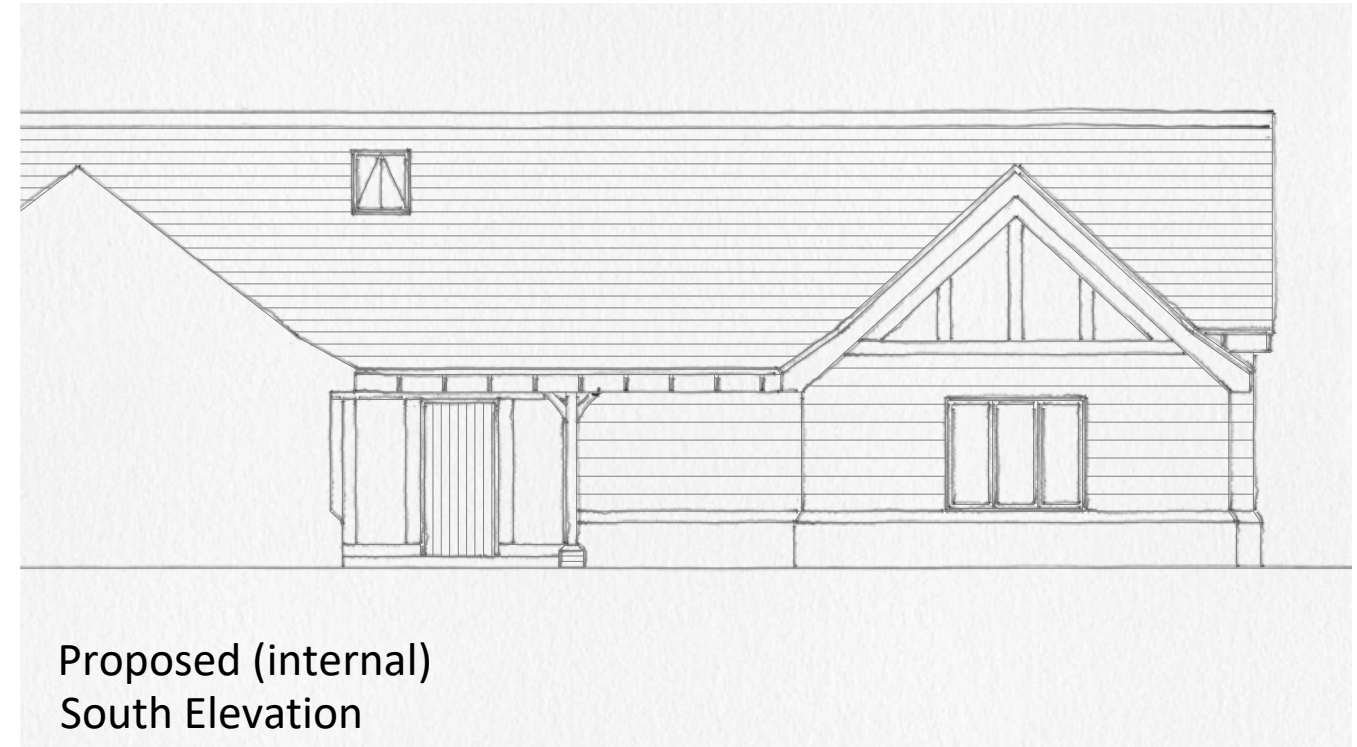
Proposed (internal) South Elevation