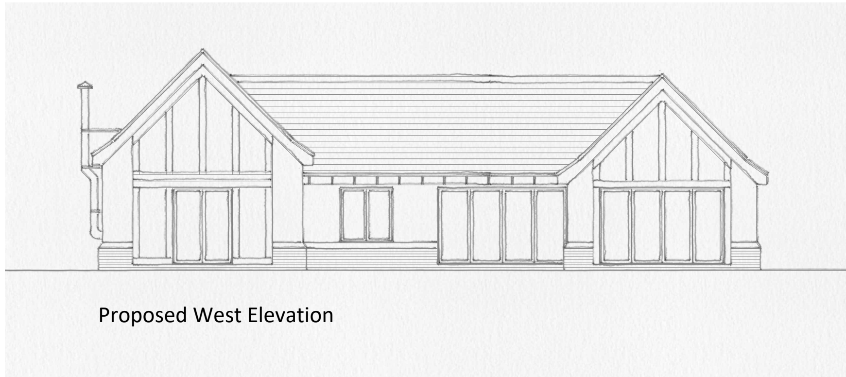
Proposed West Elevation