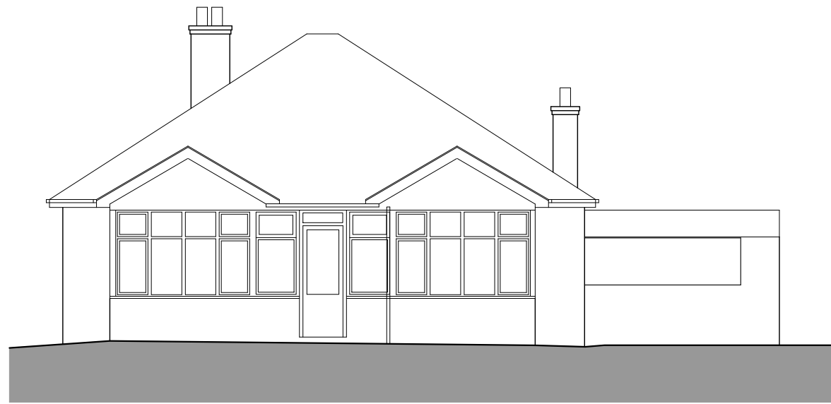
01 Front Elevation 1:100