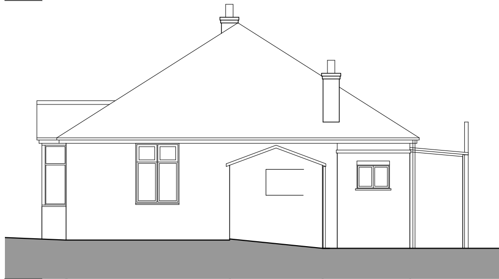
04 Side Elevation 02 1:100