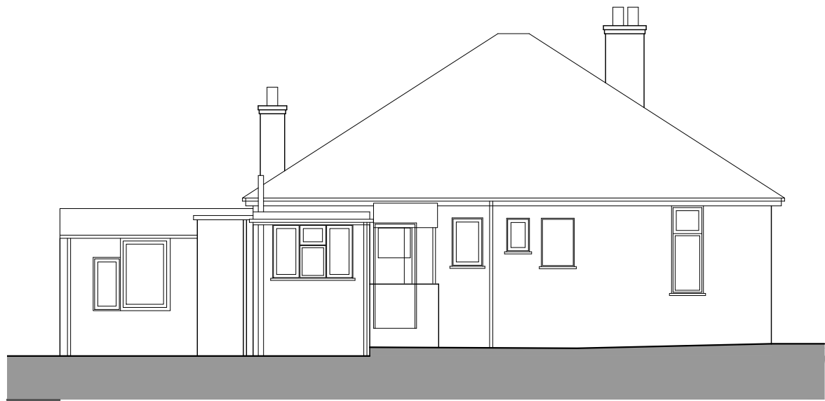
02 Rear Elevation 1:100