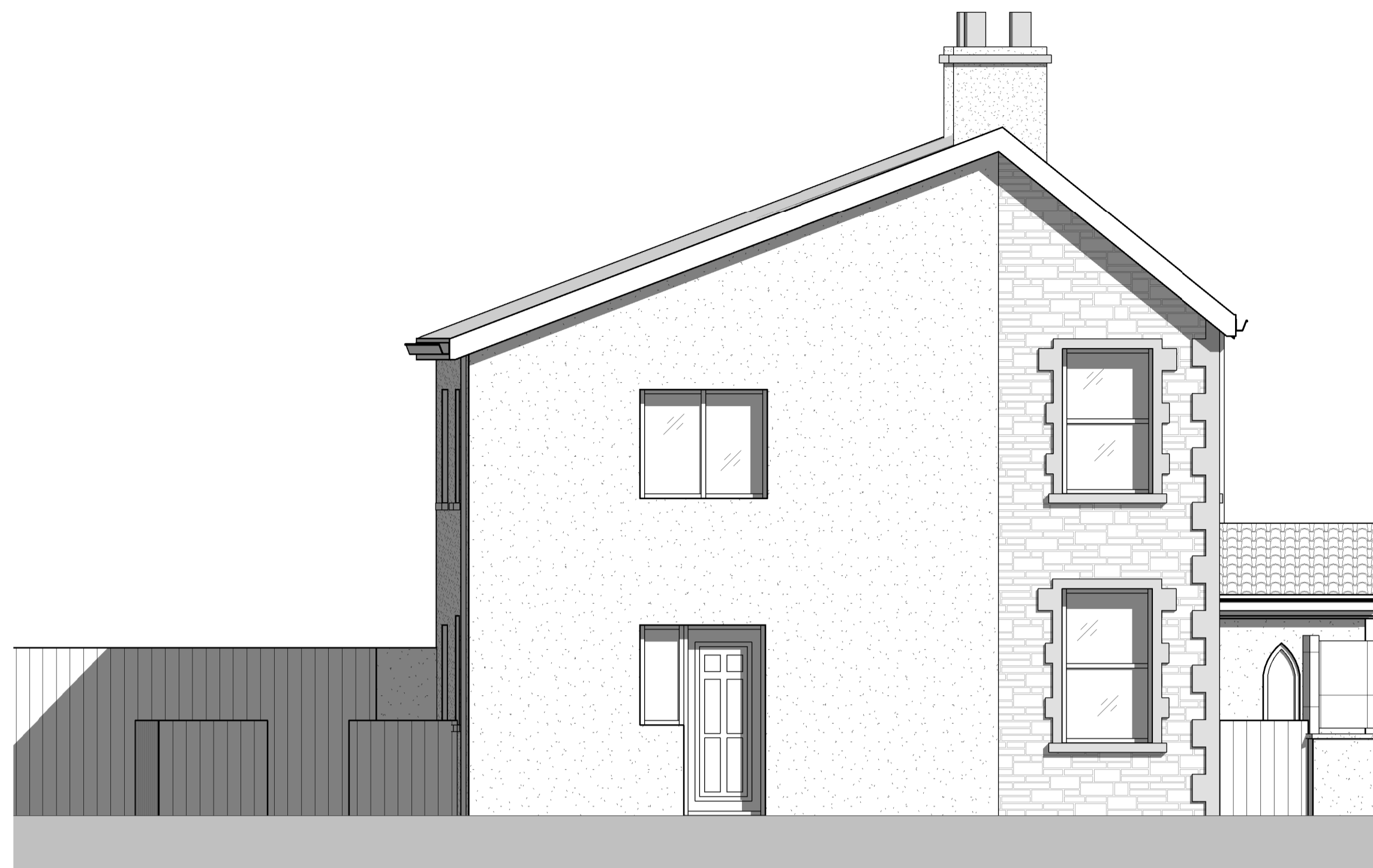
Existing Left Elevation 1:50