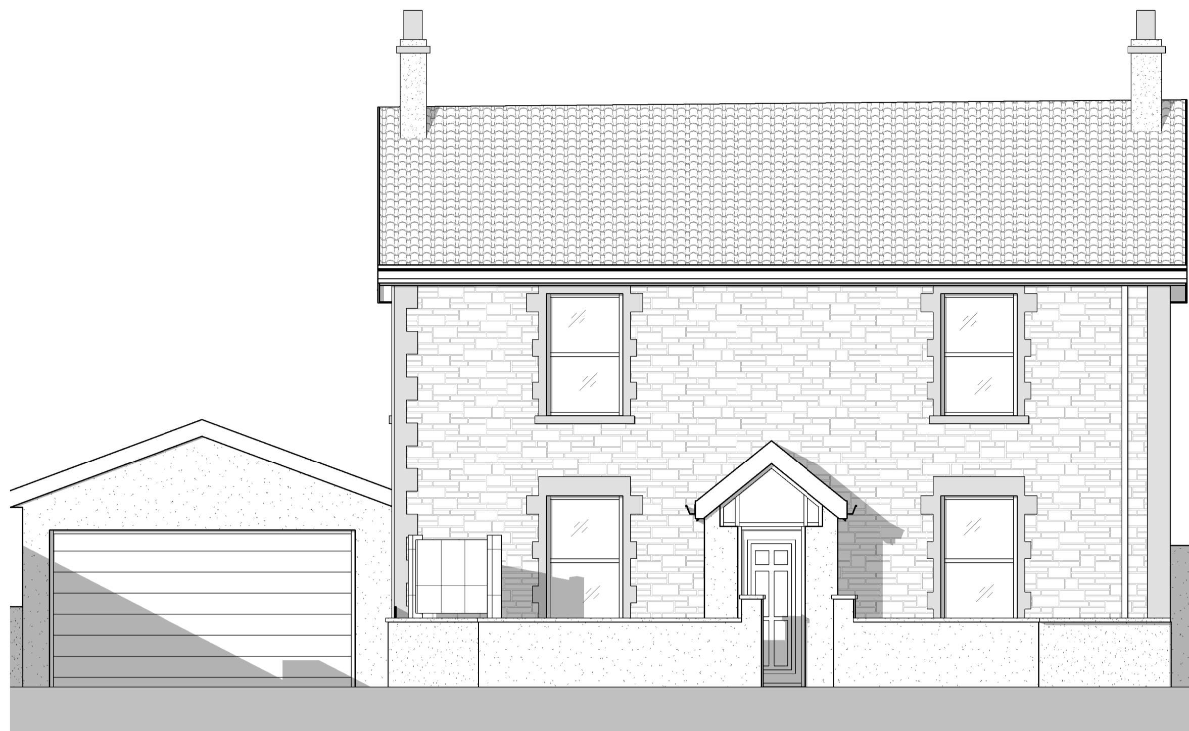
Existing Front Elevation 1:50