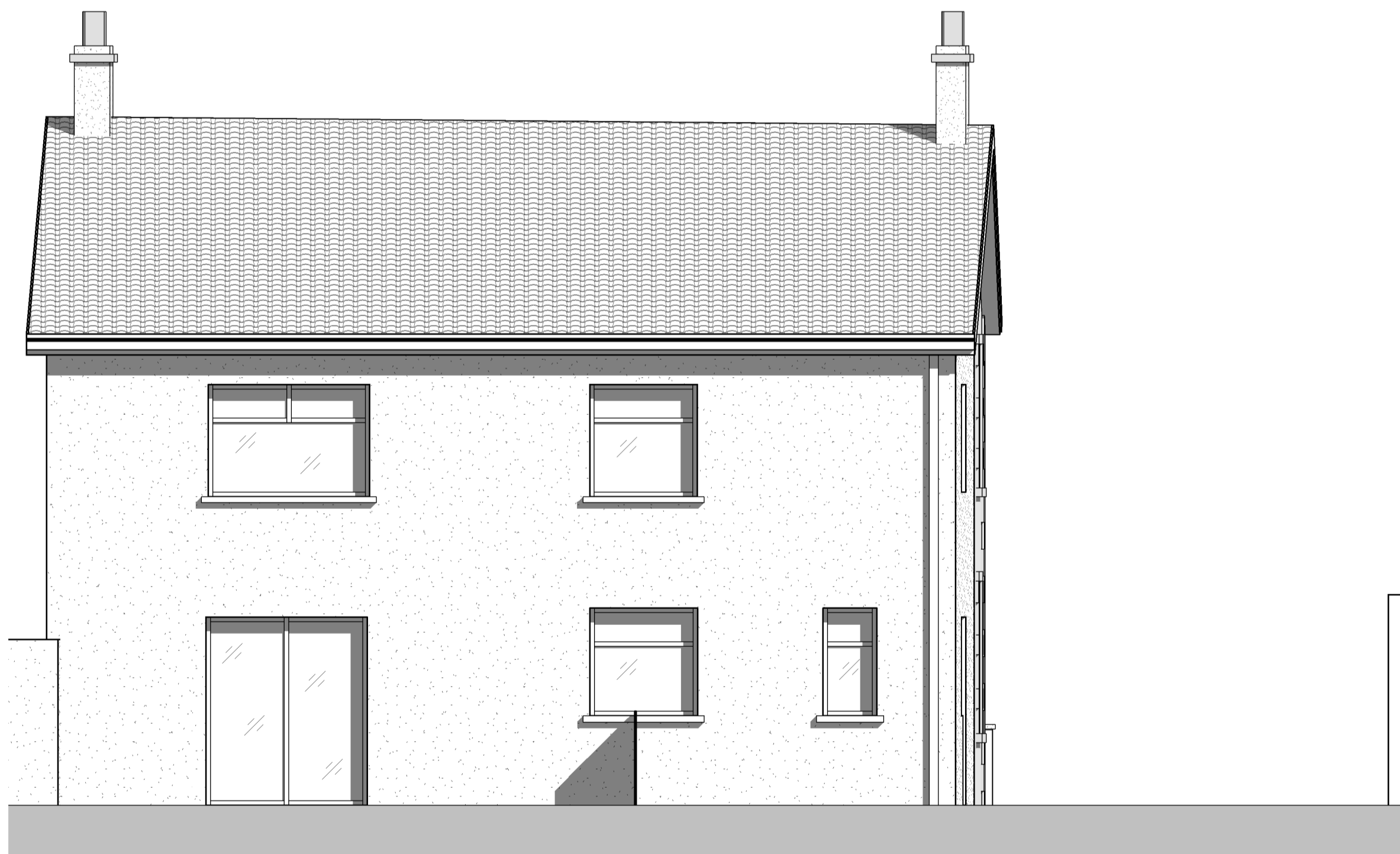
Existing Rear Elevation 1:50