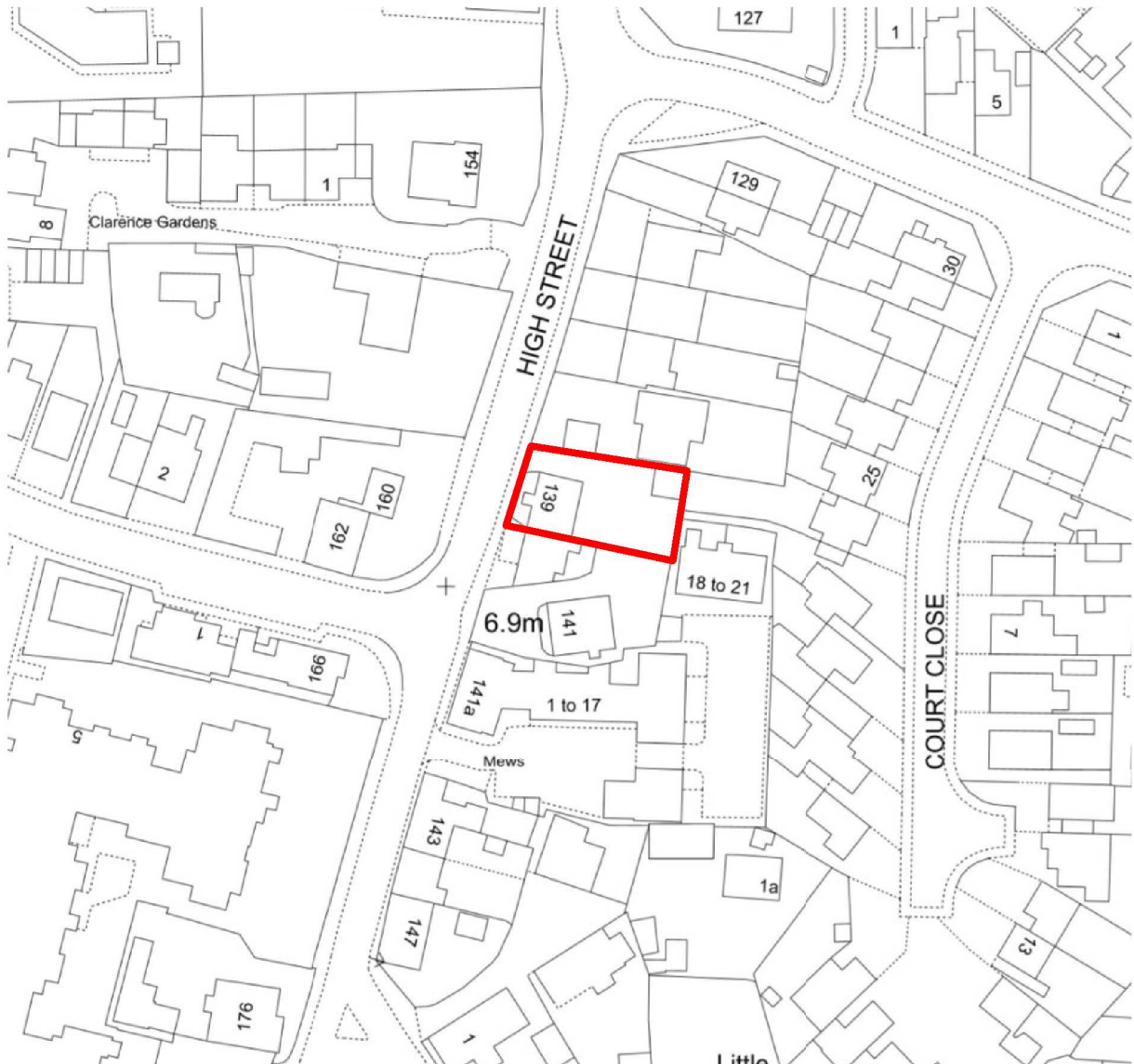
Site Plan 1 : 1250