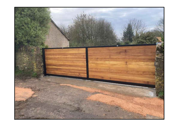
METAL FRAMED TIMBER SLIDING GATE