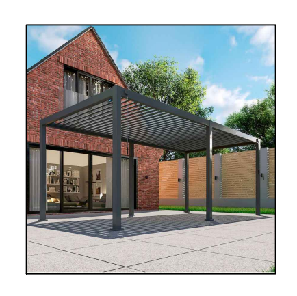
METAL FRAMED LOUVERED ROOF CANOPY