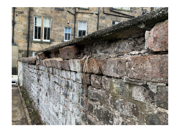
EXISTING DECAYING PARTY WALL