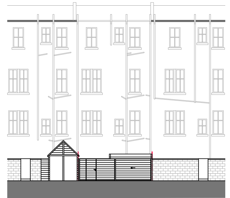
ELEVATION KEY Scale 1:200