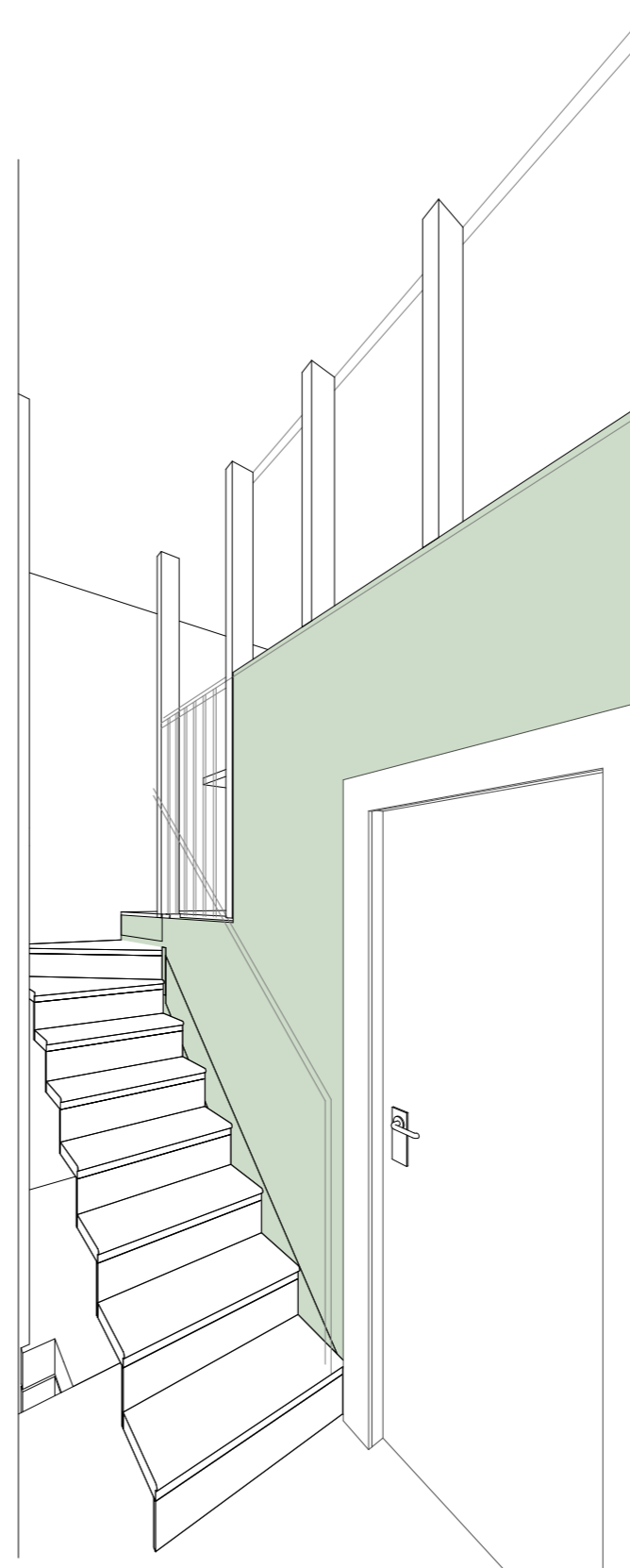
2 3D View 02 - From hall

Only scale for planning purposes. If in doubt, ask. This drawing is the property of Magnus Popplewell and must not be copied, reproduced or disclosed other than for the purposes of this project. Magnus Popplewell trading as Magnus Architect Practice.