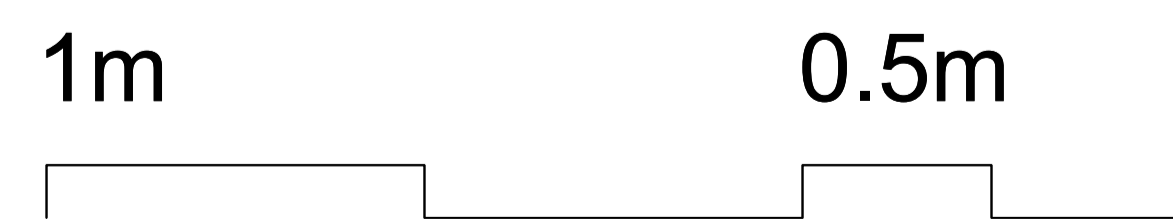
SECTION A / AS EXISTING