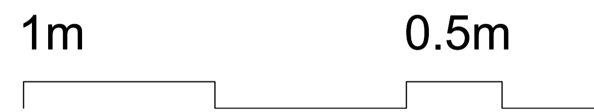
SECTION A / AS PROPOSED