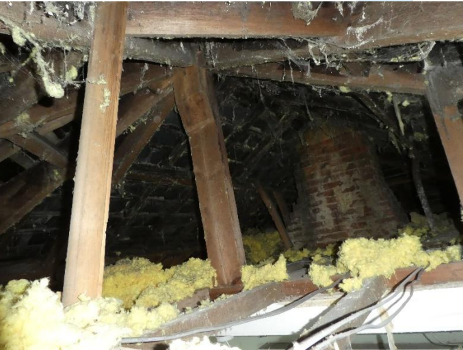
same view, further back

Roof space, Liv Room, looking West, chimney stack