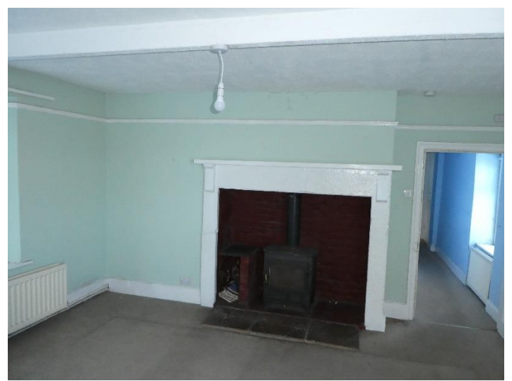
Liv Room fireplace - prior to ceiling collapse