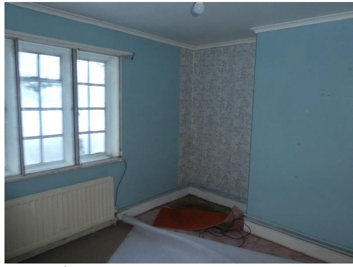
Bedroom South West corner