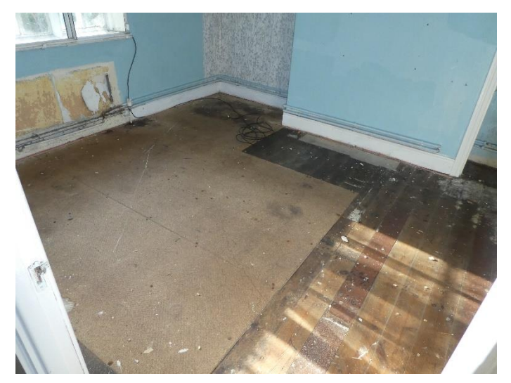
Floor, - previous repairs in particle board