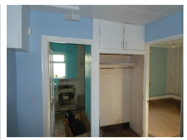
Hall, view into Bathroom