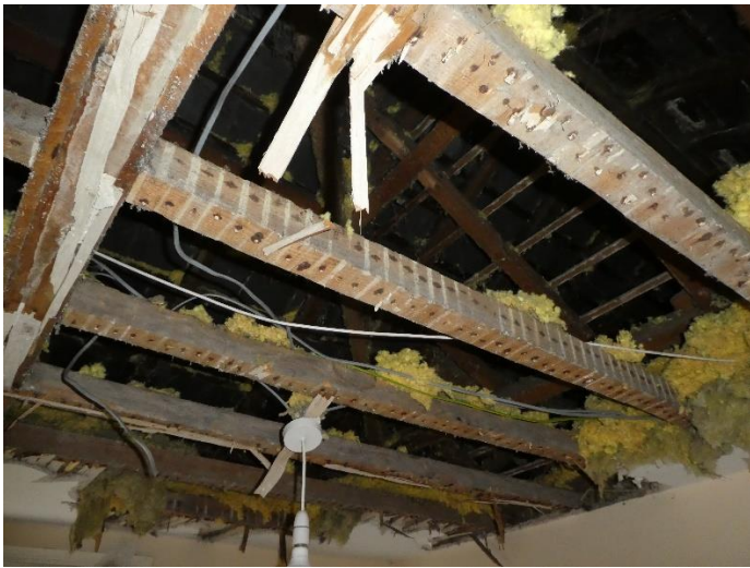
Roof space, Liv Room, looking North West,