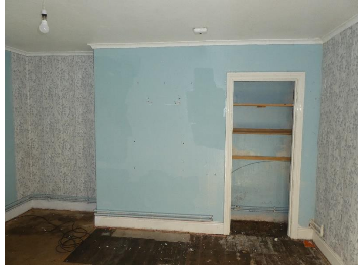
Bedroom West wall