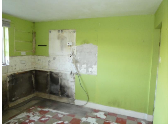
Kitchen North East corner