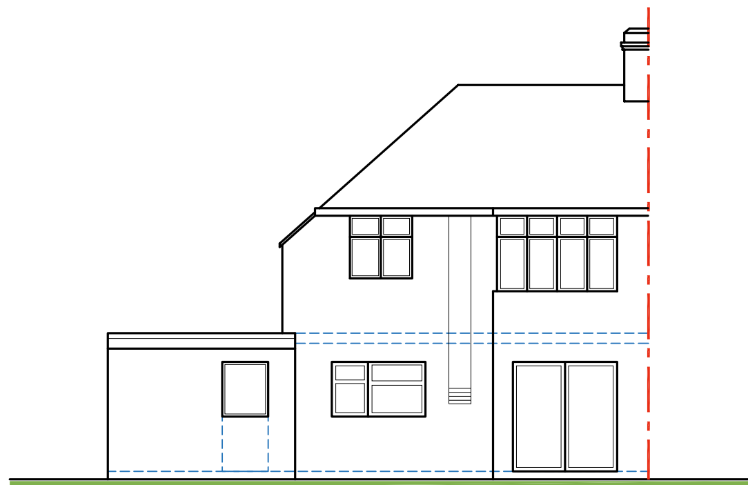
EXISTING REAR ELEVATION 1:100@A3