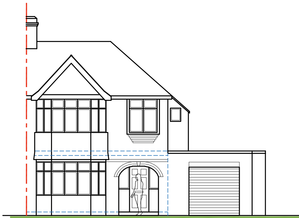
EXISTING FRONT ELEVATION 1:100@A3