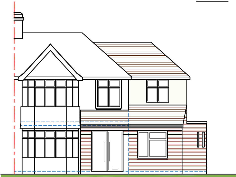
PROPOSED FRONT ELEVATION 1:100@A3