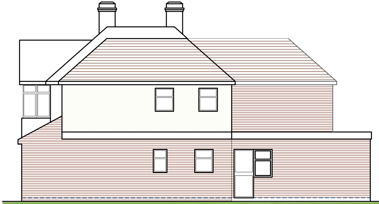
PROPOSED SIDE ELEVATION 1:100@A3