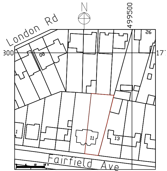
LOCATION MAP 1:1250@A3

Supplied by Streetwise Maps Ltd www.streetwise.net Licence No: 100047474