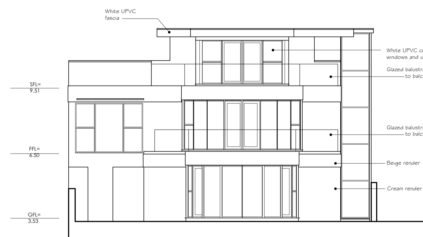
Rear Elevation - South/West