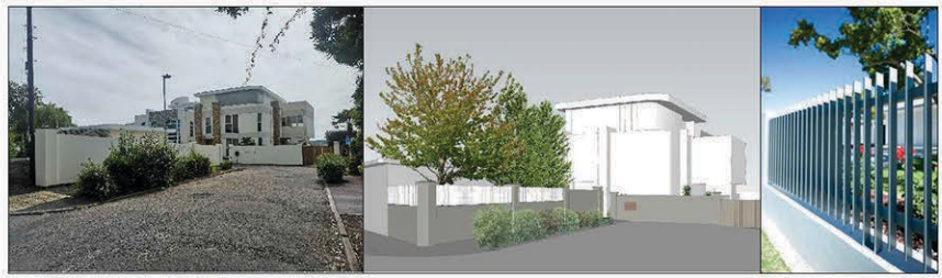
Existing house boundary to Garden Road Impression of improved boundary Style of railing to be implemented

This drawing is the copyright of LMA Architects and may not be copied or reproduced without permission. LMA Architects does not accept responsibility for errors made by others in scaling from this drawing. All construction information should be taken from figured dimensions only. If in doubt refer to LMA Architects. Dimensions for fixed items to be checked on site prior to manufacture. Main contractor to enquire into the availability of Asbestos surveys where applicable, and ensure they take their own precautions for dealing with the associated risks. Any unusual risks will be identified within the project design for construction, maintenance or demolition. End user and Main Contractor to review project with residual risks in mind and report any unforeseen previously to LMA Architects.