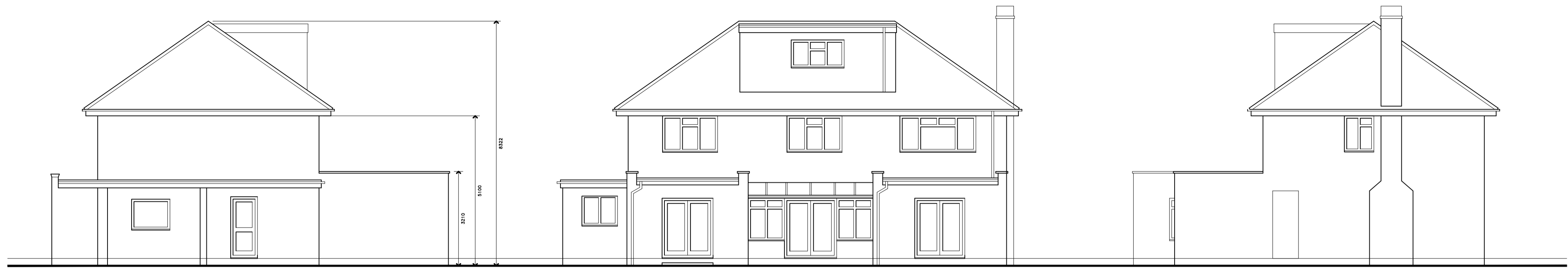
EXISTING SIDE - W