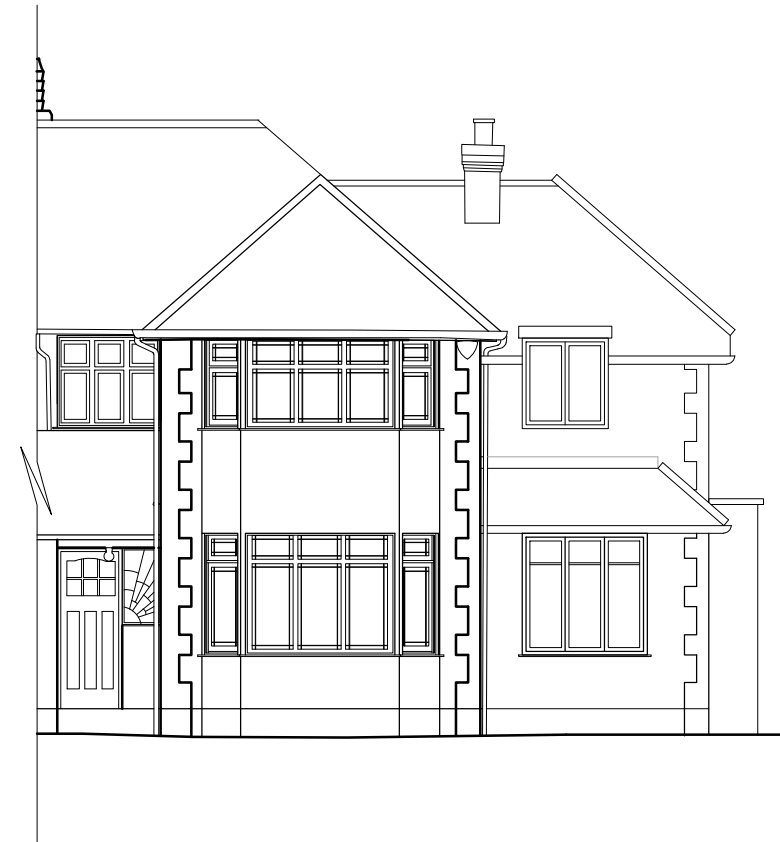
PROPOSED FRONT (WEST) ELEVATION

COMMUNITY INFRASTRUCTURE LEVY (CIL) Projects exceeding 100 sq.m. of new build may be deemed liable to the CIL levy payable to the relevant Local Authority. If CIL is applicable, the applicant may apply for an exemption on the basis of self build, annex or extension to primary residence but this must be done BEFORE commencement of construction otherwise the levy will become payable without the right of appeal. The applicant must ALSO submit a CIL Commencement Notice form BEFORE commencement of construction otherwise the levy will become payable without the right of appeal. More information is available from your Local Authority and The Planning Portal.