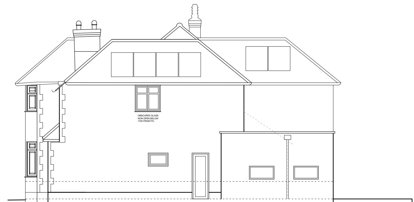
PROPOSED SIDE (SOUTH) ELEVATION