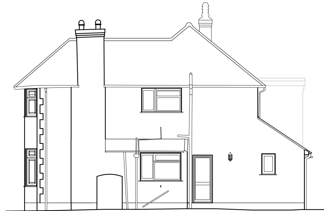
EXISTING SIDE (SOUTH) ELEVATION