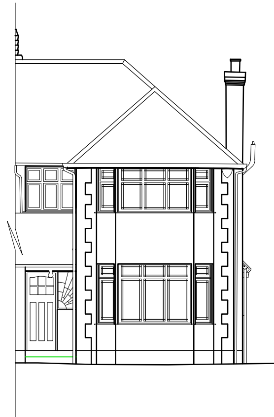
EXISTING FRONT (WEST) ELEVATION

COMMUNITY INFRASTRUCTURE LEVY (CIL) Projects exceeding 100 sq.m. of new build may be deemed liable to the CIL levy payable to the relevant Local Authority. If CIL is applicable, the applicant may apply for an exemption on the basis of self build, annex or extension to primary residence but this must be done BEFORE commencement of construction otherwise the levy will become payable without the right of appeal. The applicant must ALSO submit a CIL Commencement Notice form BEFORE commencement of construction otherwise the levy will become payable without the right of appeal. More information is available from your Local Authority and The Planning Portal.