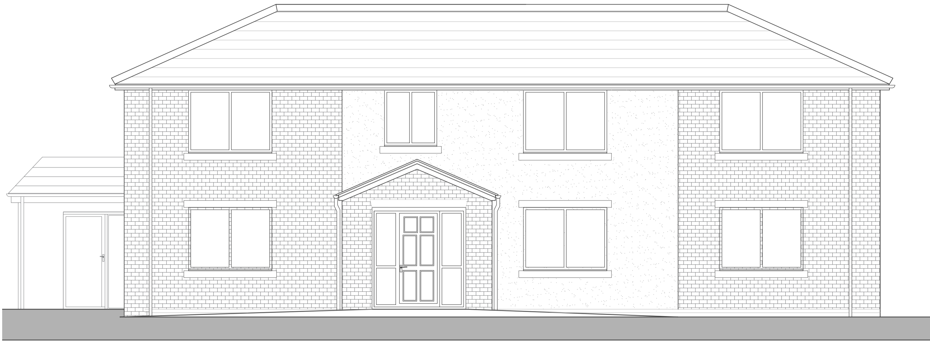
Front Elevation 1:50

Designer takes no responsibility for any dimensions obtained by scaling from this drawing. If no dimension is shown the recipient must ascertain the dimension specifically from the Designer or by site measurement. Supplying this drawing in digital form is solely for convenience and no reliance may be placed on digital data. All data must be checked against hard copy. Dimensions must be checked on site. Any discrepancies must be reported to the Designer immediately. This drawing is copyright of Duke Design Services