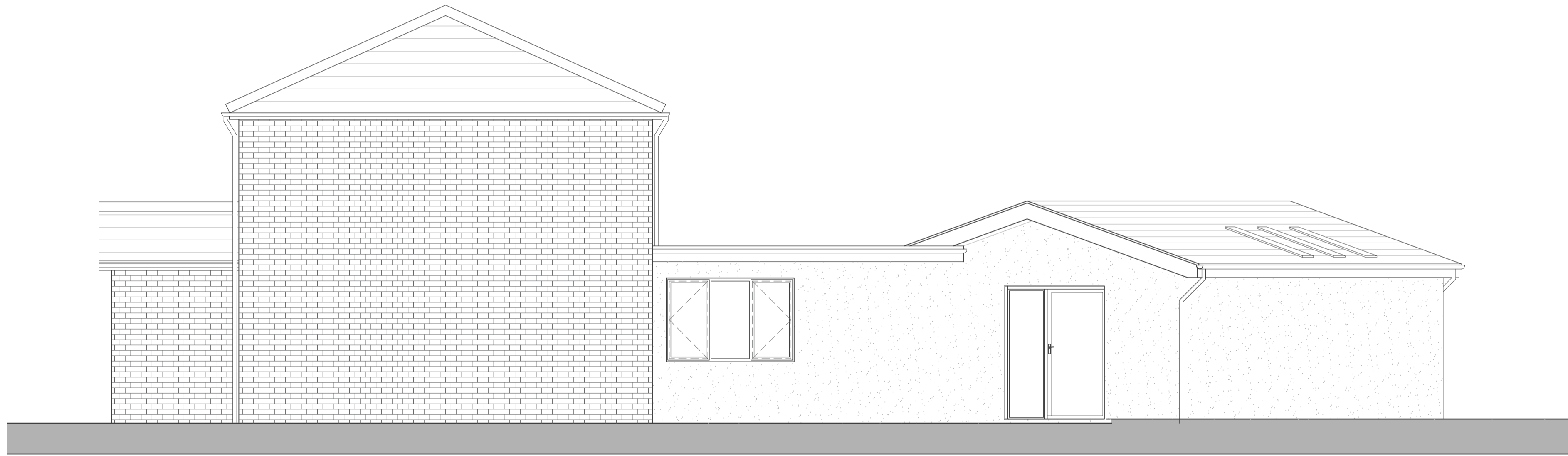
Side Elevation 1:50