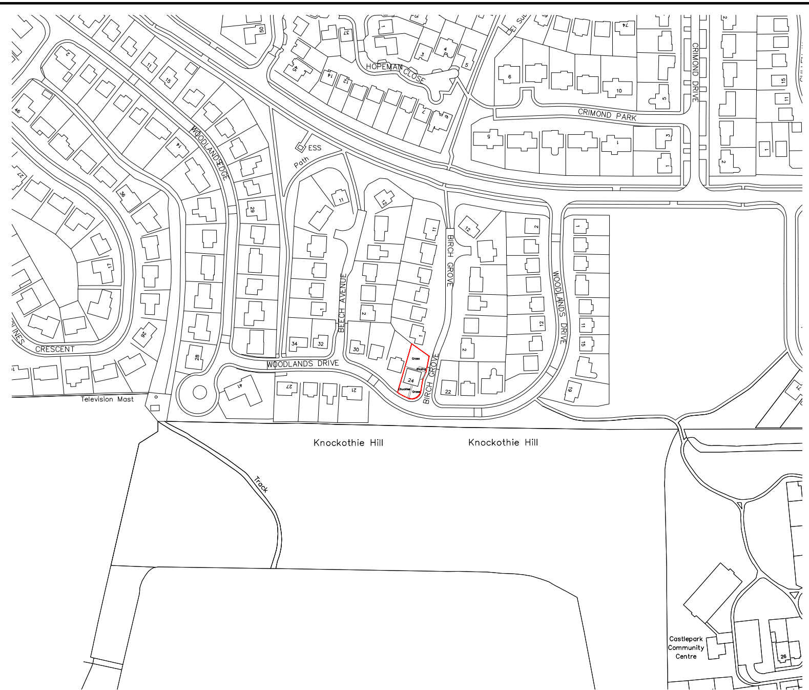
Location Plan Scale 1:2500