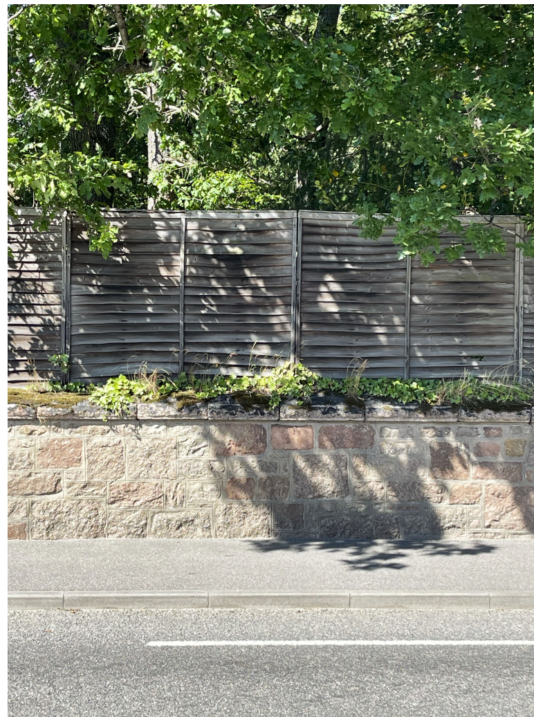
Precedent - Nearby property - Fence to Ballater Road