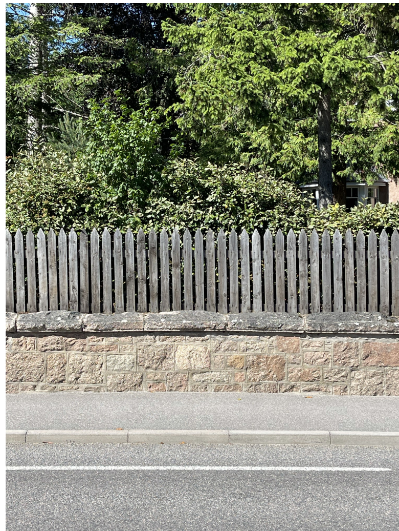
Precedent - Neighbouring property - Fence to Ballater Road