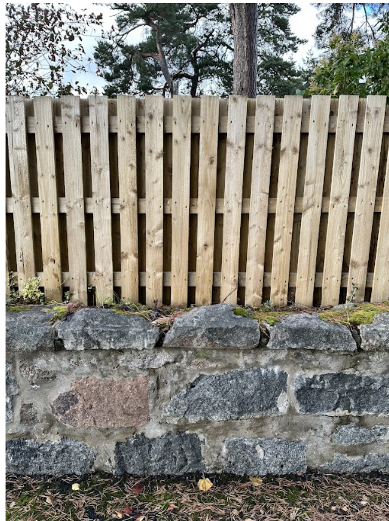
Precedent - Nearby property - Fence to Ballater Road

do not scale drawing, note dimensions only, if in doubt seek clarification