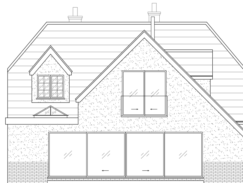
1:100 Proposed Rear Elevation