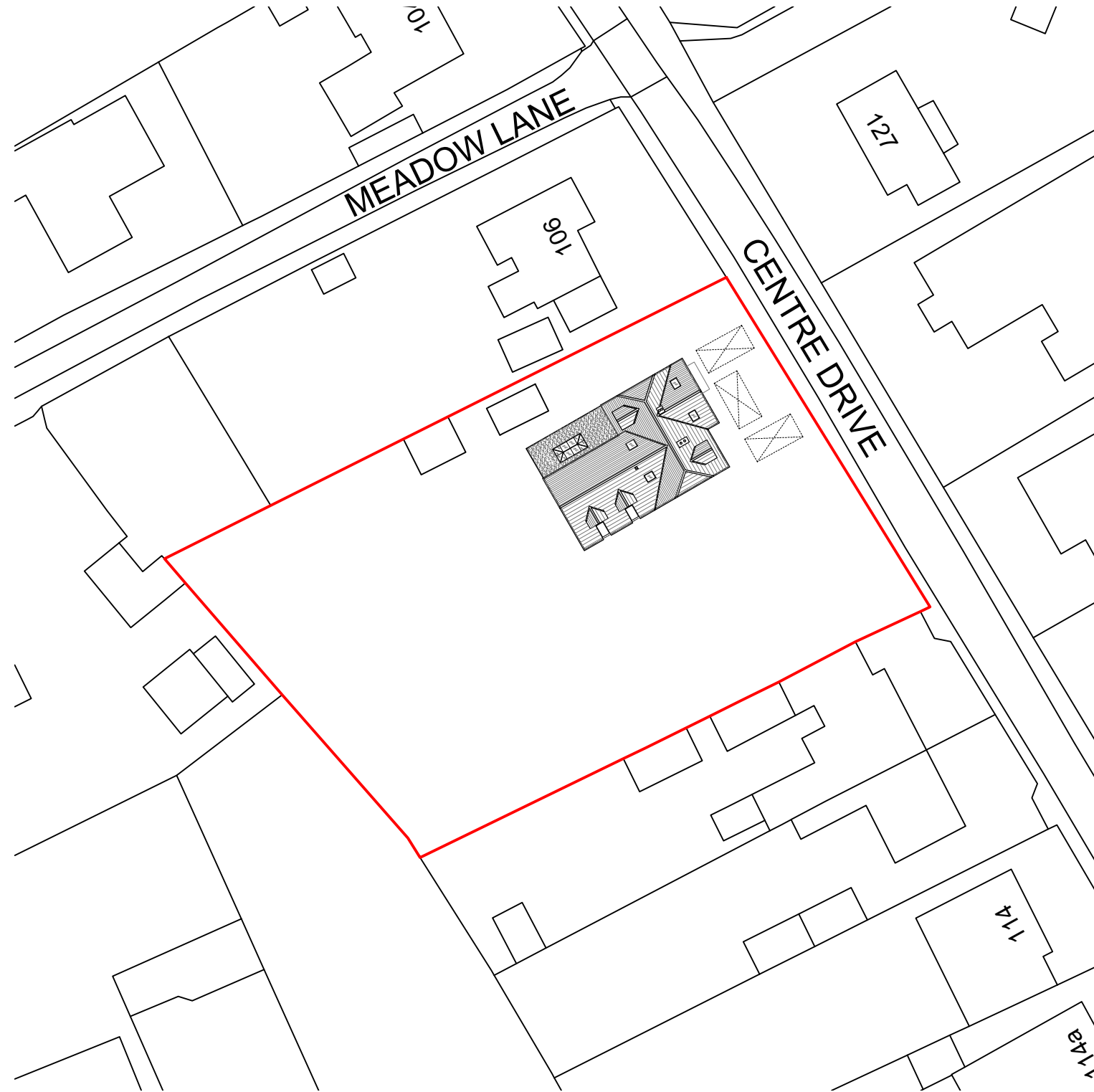
1:500 Proposed Site Plan