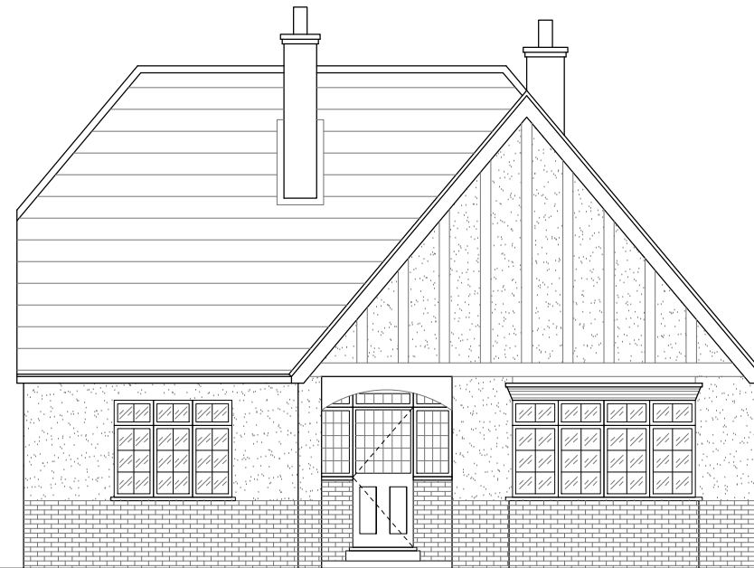
1:100 Existing Front Elevation

TAB Architecture Ltd Unit 13 E-Space South, 26 St Thomas Place, Ely, Cambridgeshire, CB7 4EX email: info@tabarchitecture.co.uk tel: 01638 505365