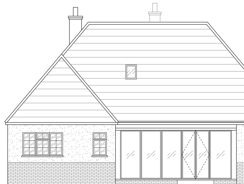
1:100 Existing Rear Elevation