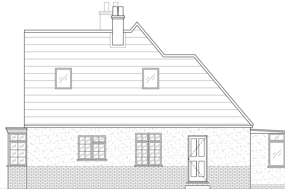
1:100 Existing Side Elevation

Unit 13 E-Space South, 26 St Thomas Place, Ely, Cambridgeshire, CB7 4EX email: info@tabarchitecture.co.uk tel: 01638 505365