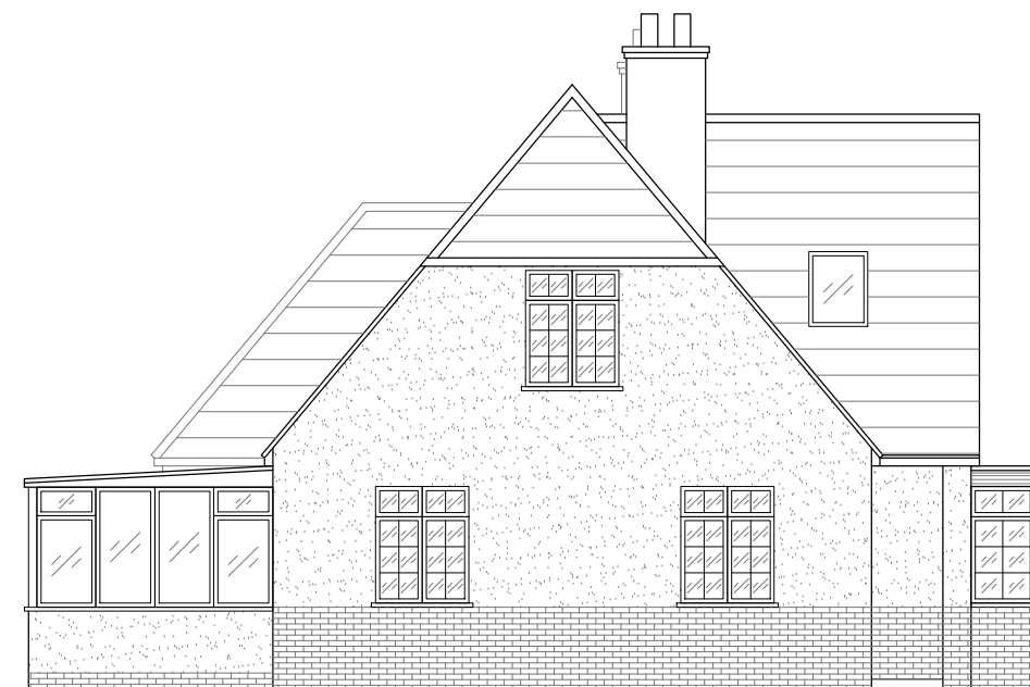
1:100 Existing Side Elevation