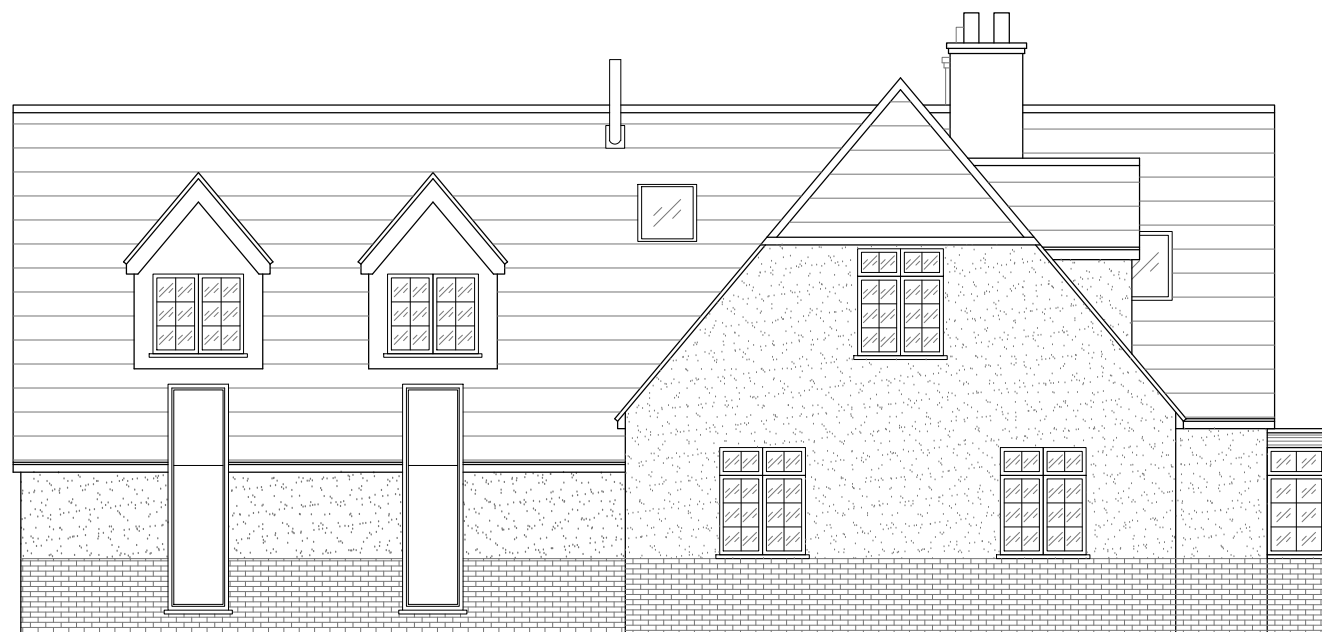
1:100 Proposed Side Elevation