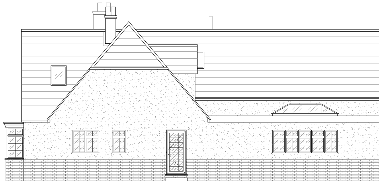
1:100 Proposed Side Elevation

TAB Architecture Ltd Unit 13 E-Space South, 26 St Thomas Place, Ely, Cambridgeshire, CB7 4EX email: info@tabarchitecture.co.uk tel: 01638 505365