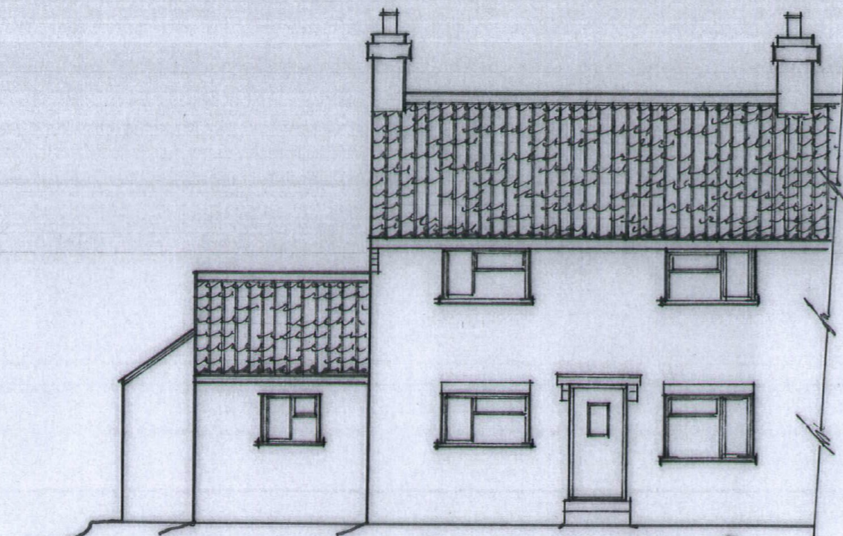
EAST ELEVATION. (no changes proposed).