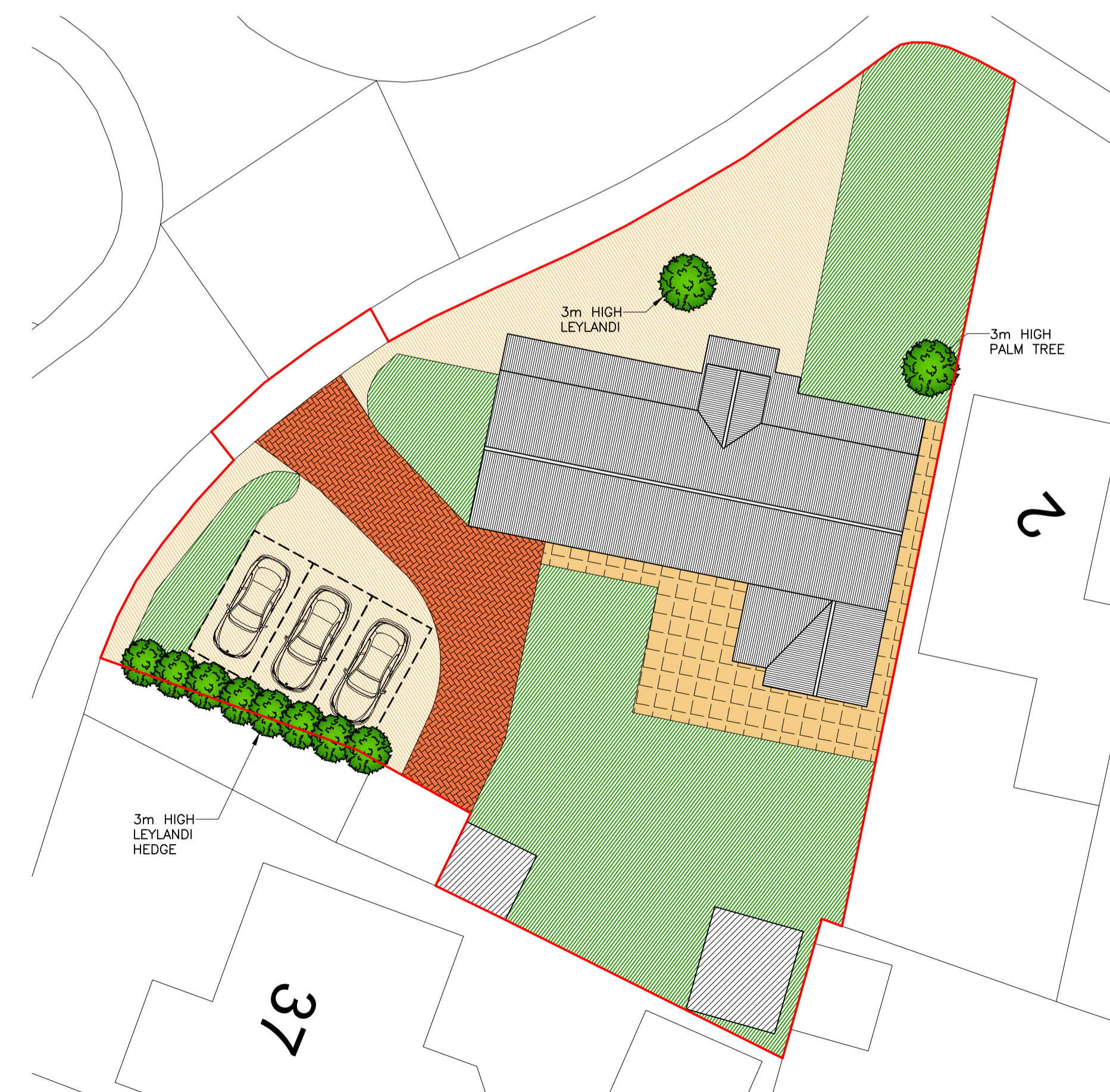
PROPOSED SITE PLAN (1:200)

Copyright on all drawings prepared by Morton & Hall Consulting Limited is their property. Drawings and designs may not be reproduced in part or in whole without their written permission. Please read, if in doubt ask. Change nothing without consulting the Engineers. Contractor to check all dimensions on site before work starts or materials are ordered. If in doubt ask. All dimensions are in mm unless stated otherwise. Where materials, products and workmanship are not fully specified they are to be of the standard appropriate to the works and suitable for the purpose stated in or reasonably to be inferred from the drawings and specification. All work to be in accordance with good building practice and BS 8000 to the extent that the recommendations define the quality of the finished work. Materials products and workmanship to comply with all British Standards and EOTA standards with, where appropriate, BS or EC marks. All products and materials to be handled, stored, prepared and used or fixed in accordance with the manufacturers current recommendations. The contractor is to arrange inspections of the works by the BCO (or NHBC) as required by the Building Regulations and is to obtain completion certificate and forward to the Engineer