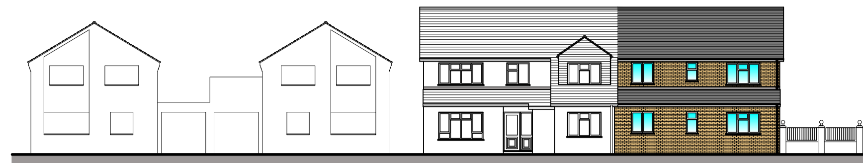
PROPOSED STREET SCENE (1:200)