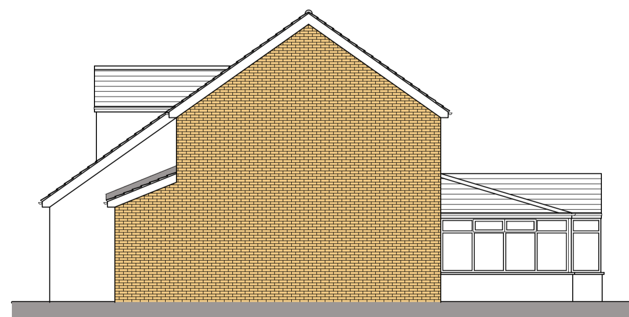
PROPOSED RHS ELEVATION (1:100)