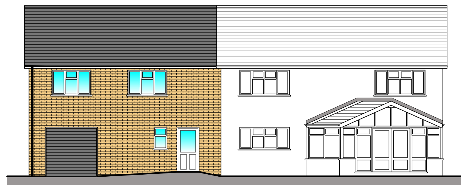
PROPOSED REAR ELEVATION (1:100)