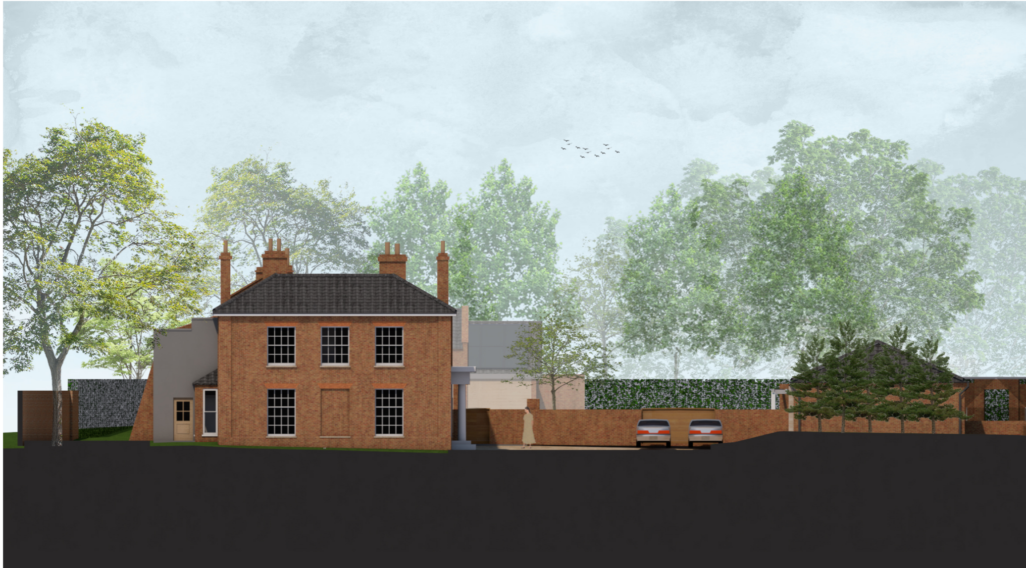
PROPOSED SOUTH ELEVATION RENDERED NOT TO SCALE (ILLUSTRATIVE ONLY) FOR SCALED DRAWING REFER TO PL-202