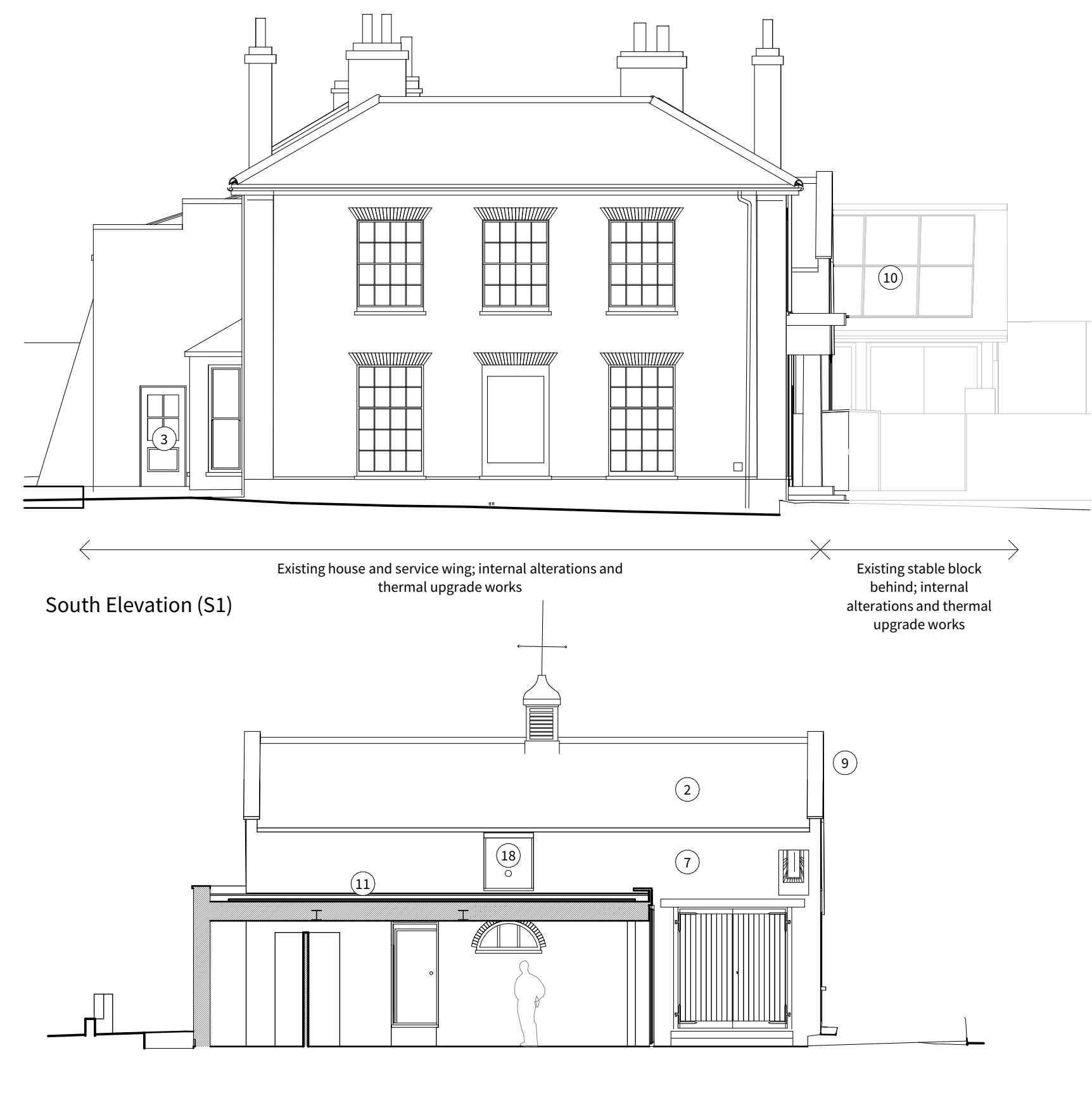
South Elevation (S2)