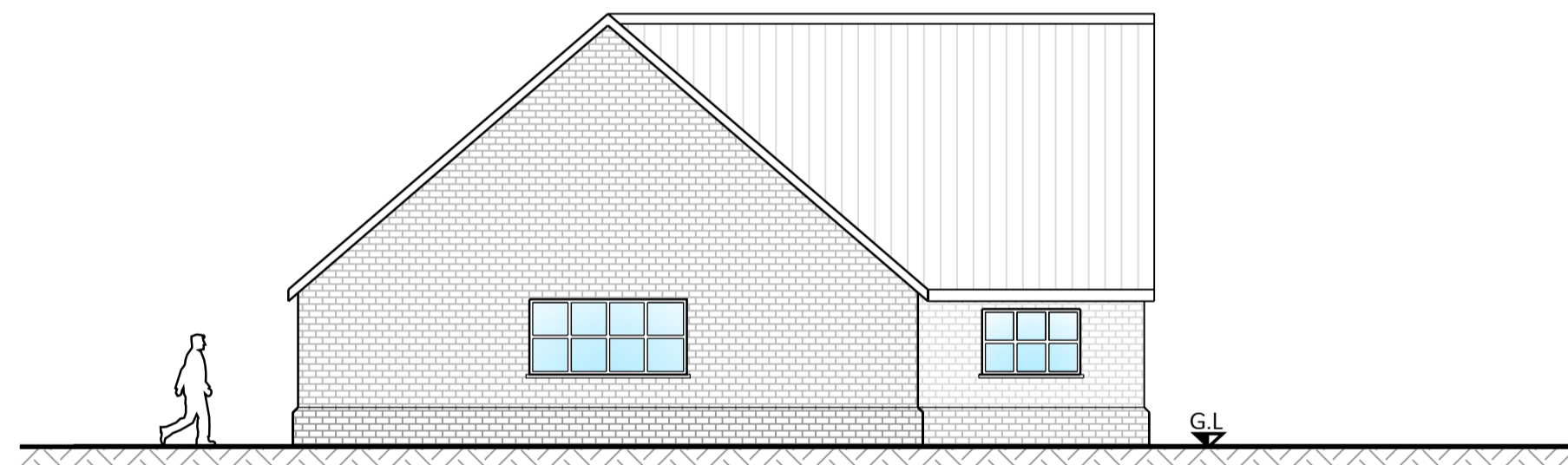
Front Elevation (Road facing)