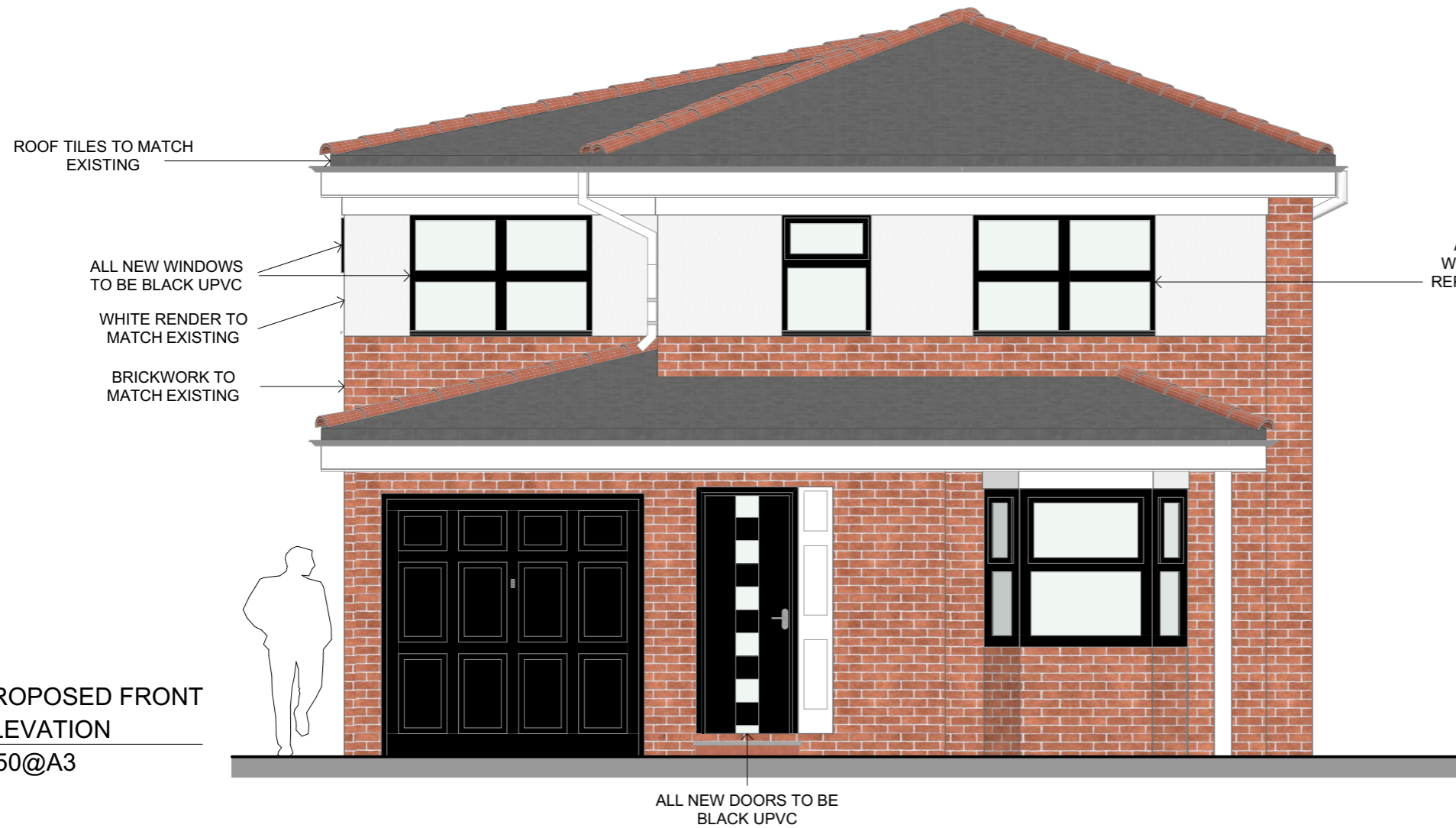
PROPOSED FRONT ELEVATION 1:50@A3

THE OWNER AND OR MAIN CONTRACTOR ARE RESPONSIBLE FOR OBTAINING ALL NECESSARY SERVICES. INFORMATION FOR WATER SUPPLY PIPES & WATER MAINS, FOUL & SURFACE WATER DRAINS AND SEWAGE PIPES, GAS SUPPLY AND MAIN PIPES, ELECTRICITY SUPPLY & MAIN CABLES (UNDERGROUND OR ABOVE GROUND AND ALL TELECOMS AND I.T. EQUIPMENT ON OR IMMEDIATELY AROUND THE SITE AND WHICH MIGHT BE EFFECTED BY THE PROPOSED BUILDING WORKS). ANY SERVICES INDICATED ON THE DRAWINGS AND THEIR POSITION AND SIZE ETC. MUST BE CHECKED AND ESTABLISHED BY THE MAIN CONTRACTOR. IT WILL BE NECESSARY FOR THE CONTRACTOR TO EITHER ALLOW A CONTINGENCY FOR THE POSSIBLE MOVING OF SERVICES OR NOTING EXCLUSIONS IN THEIR TENDER.