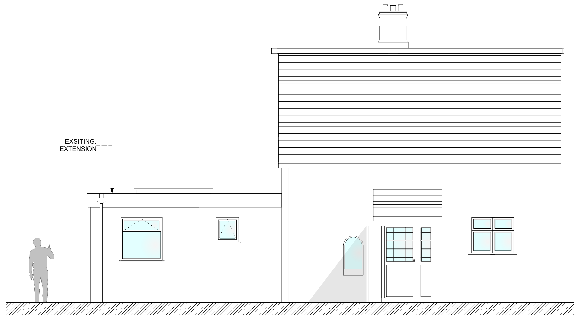
1 Existing East Elevation Scale: 1:50

Contractors must check all dimensions on site. Only figured dimensions are to be worked from. Discrepancies must be reported to the Architect or Engineer before proceeding. © This drawing is copyright