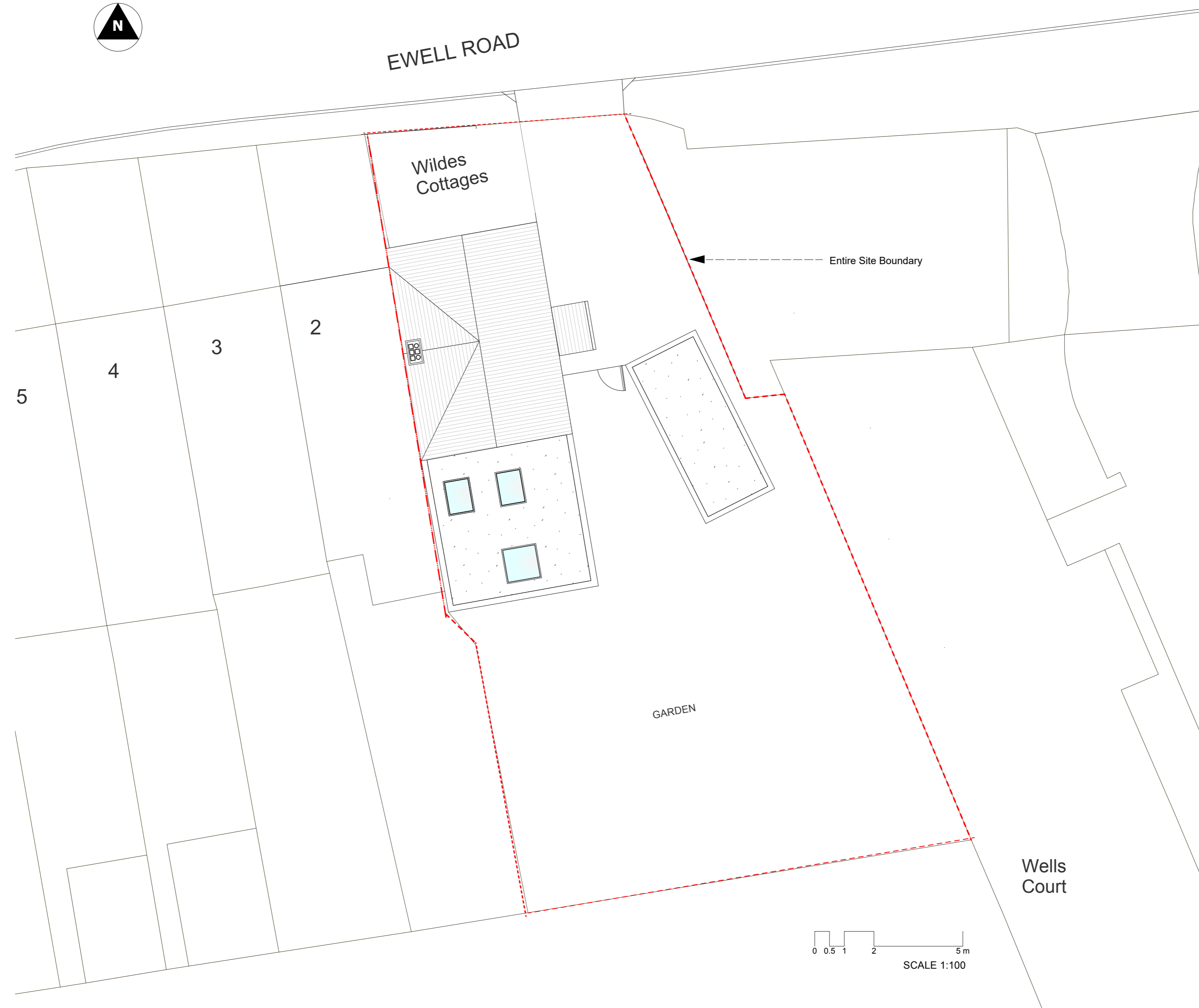
1 Existing Roof Plan Scale: 1:100

Contractors must check all dimensions on site. Only figured dimensions are to be worked from. Discrepancies must be reported to the Architect or Engineer before proceeding. © This drawing is copyright