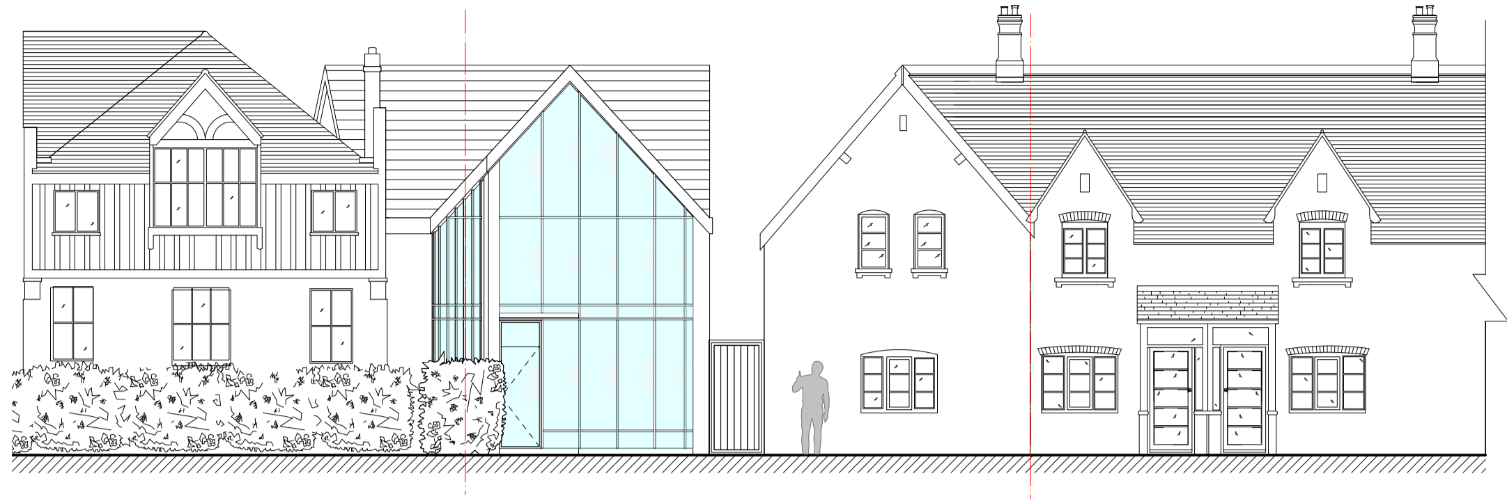
1 Proposed Street Scene Elevation Scale: 1:100

Contractors must check all dimensions on site. Only figured dimensions are to be worked from. Discrepancies must be reported to the Architect or Engineer before proceeding. © This drawing is copyright