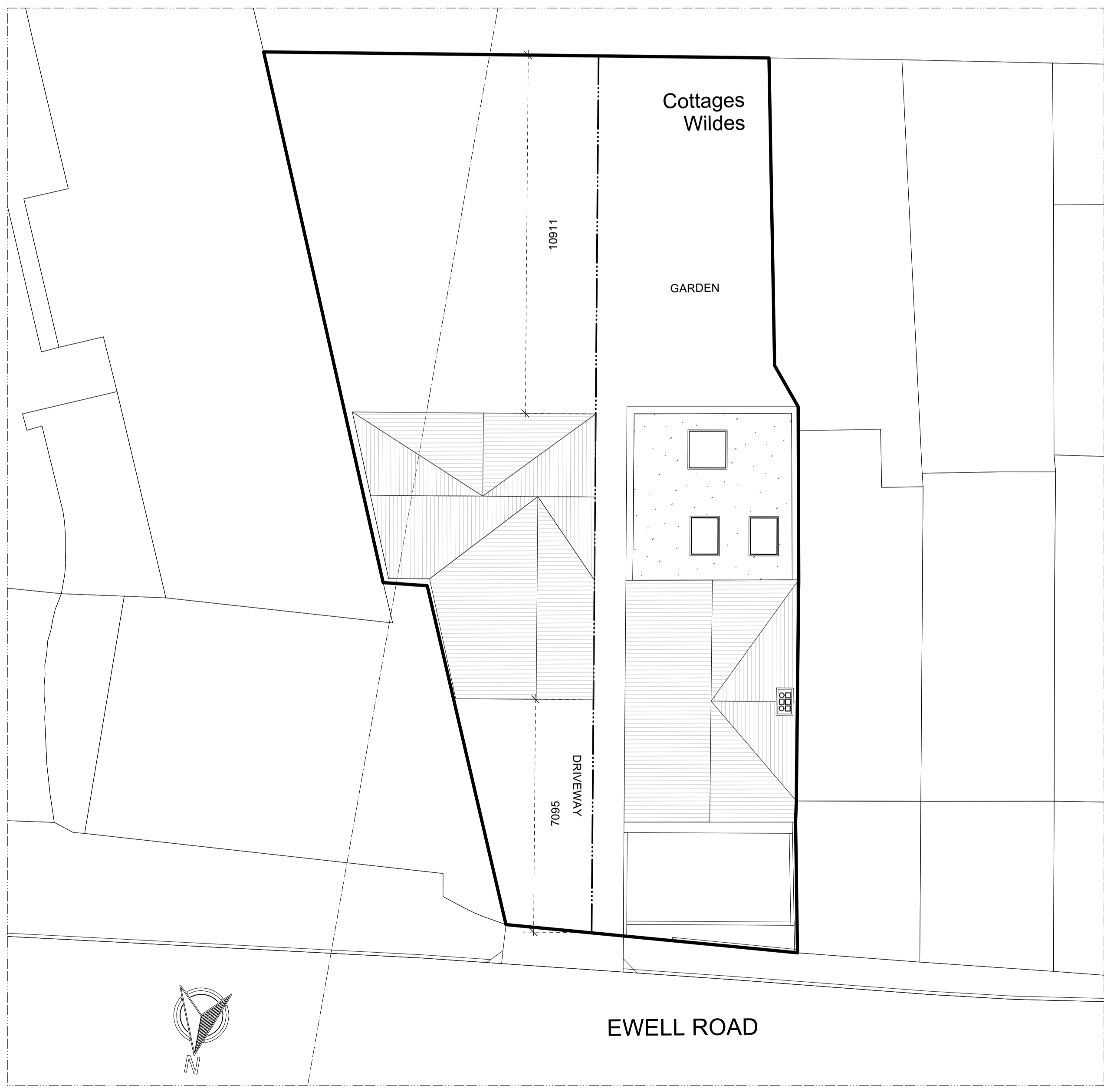
2 Proposed Block Plan Scale: 1:100