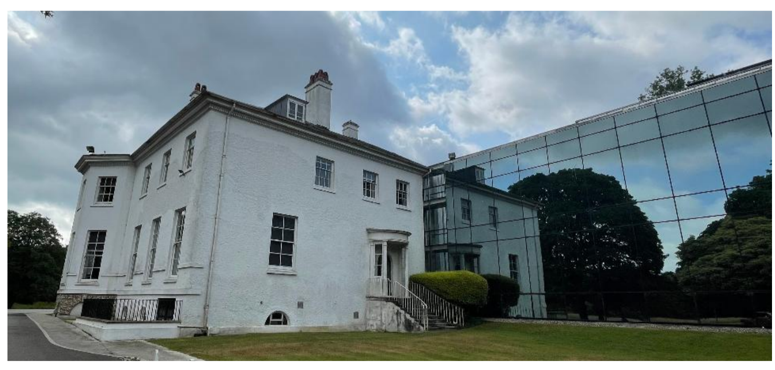
Design inspiration examples - this proposal is for a one-way mirrored glass dwelling, reflecting the greenery of Cheam Park.