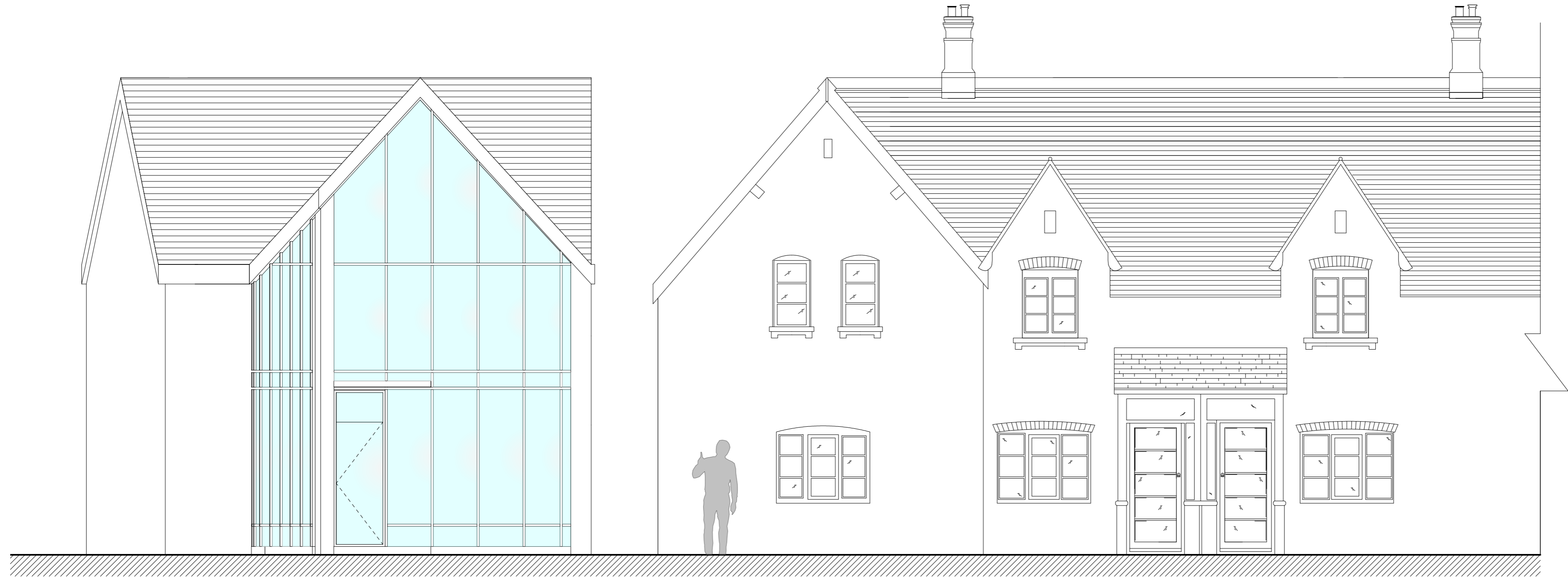
1 Wildes Cottages Combined Front Elevation Scale: 1:50

Contractors must check all dimensions on site. Only figured dimensions are to be worked from. Discrepancies must be reported to the Architect or Engineer before proceeding. © This drawing is copyright