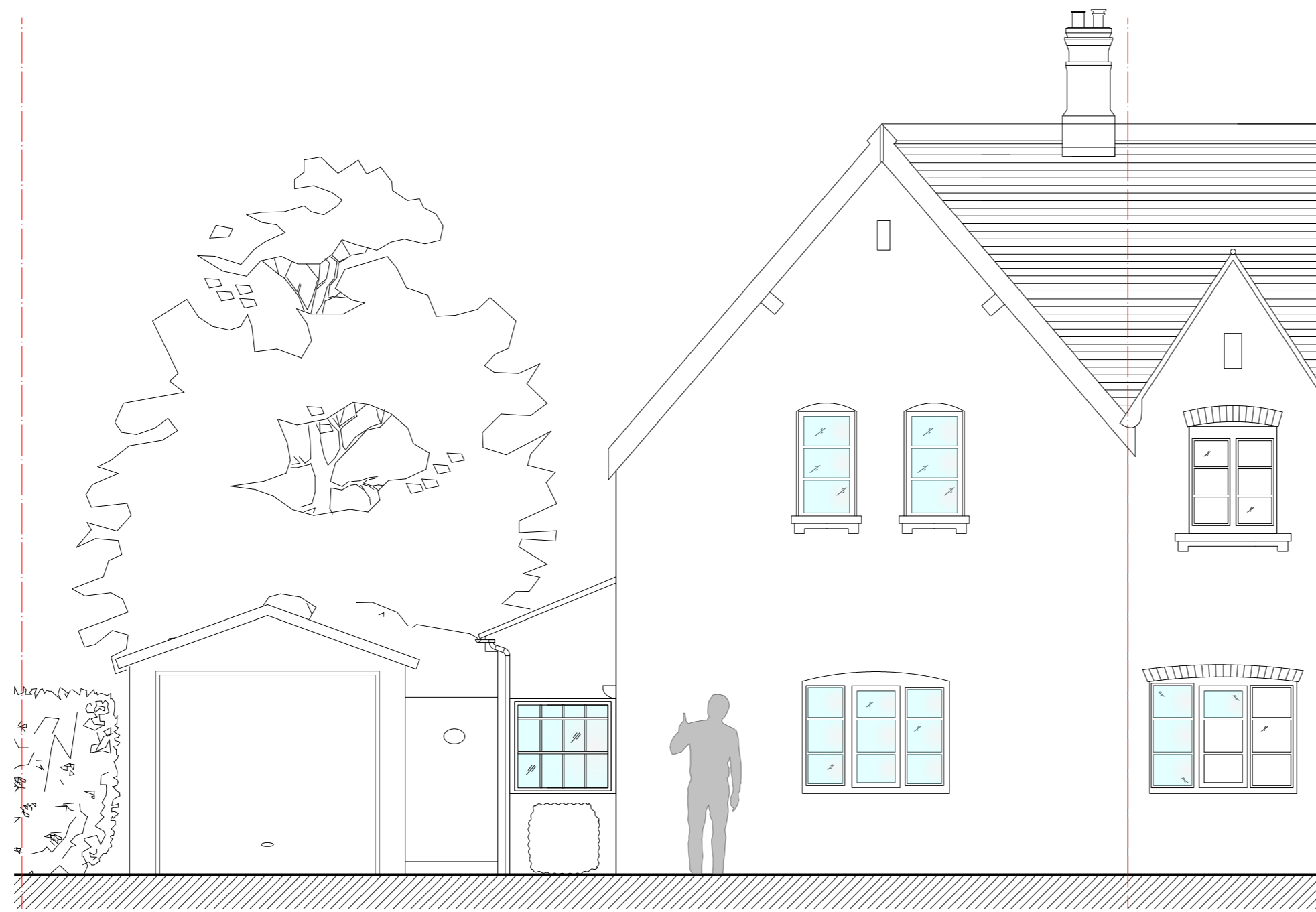
1 Existing Front Elevation Scale: 1:50

Contractors must check all dimensions on site. Only figured dimensions are to be worked from. Discrepancies must be reported to the Architect or Engineer before proceeding. © This drawing is copyright